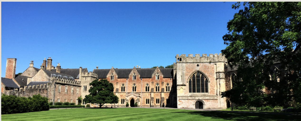
The Bishop's Palace and Gardens, Wells