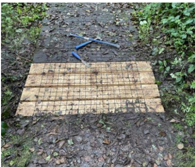
Ongoing board walk repairs in BI