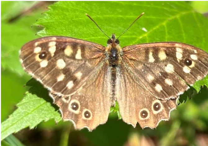
Speckled Wood, Local Nature Reserve