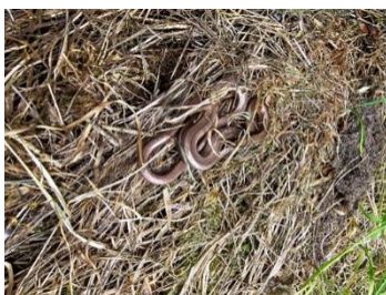
Slow worms breeding