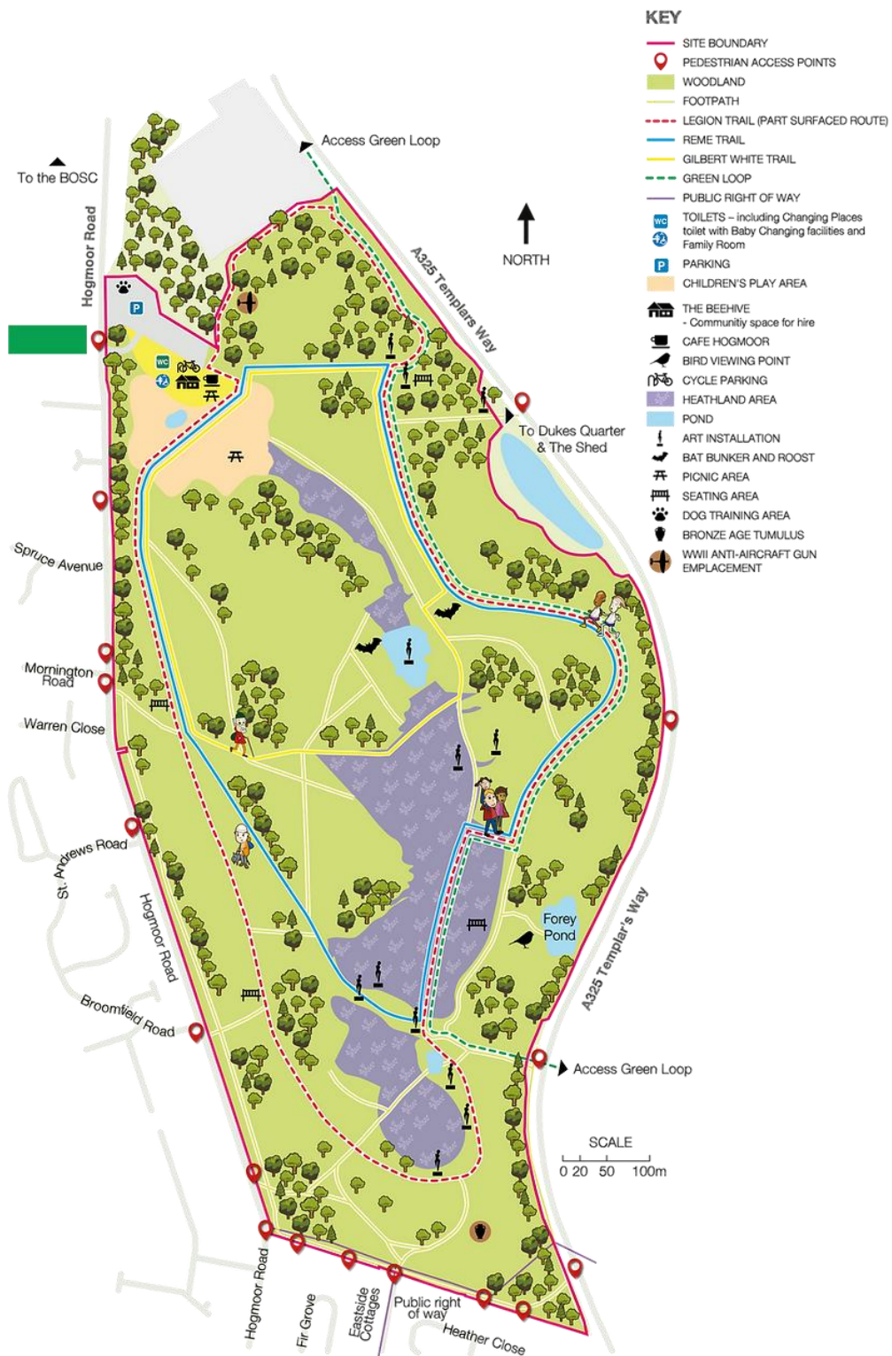
Map of Hogmoor Inclosure