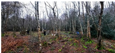
Volunteers working in BI