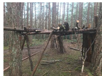
Den built using nails into living trees