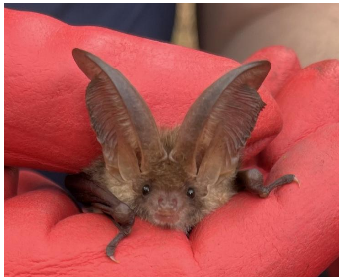
Brown long-eared bat being gently handled by a licenced professional