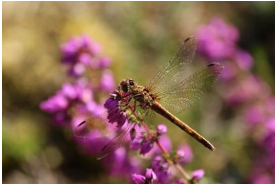
Dragonfly resting on heather