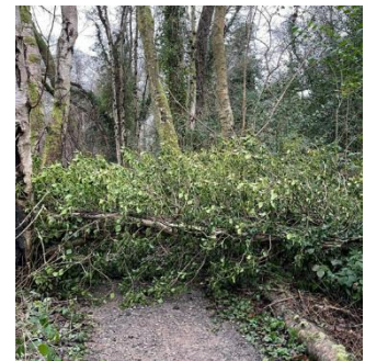
Windblown tree in LNR