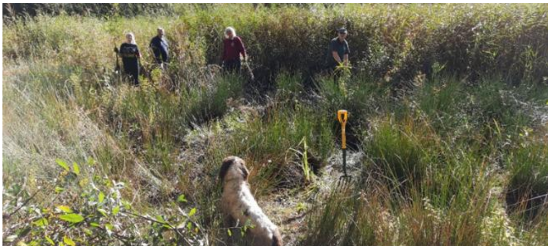
Volunteers on Forey Pond