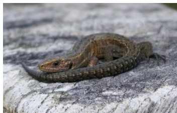
Common Lizard, Alexandra Park