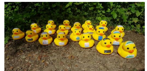
Business Ducks ready to race in LNR