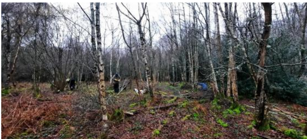
Volunteers working in Bordon Inclosure