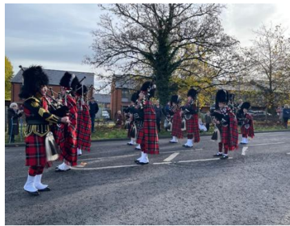
Remembrance Day Parade