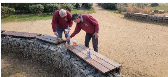
Special Projects Group varnishing newly installed benches