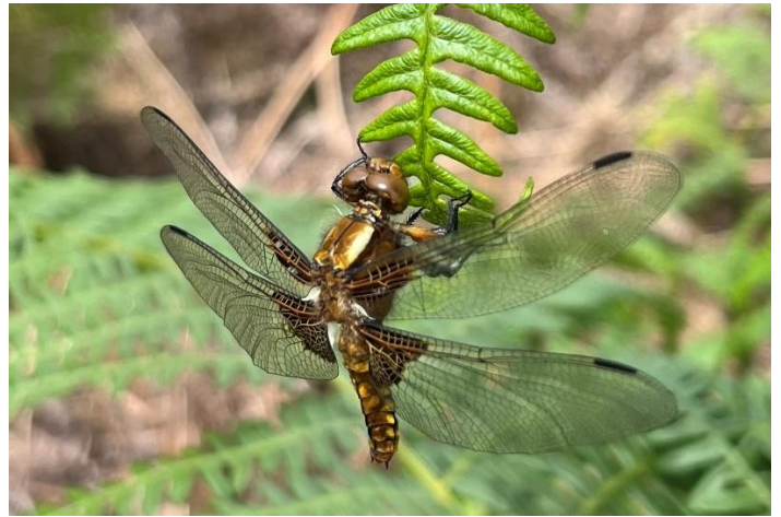
Broad-bodied Chaser, Hogmoor