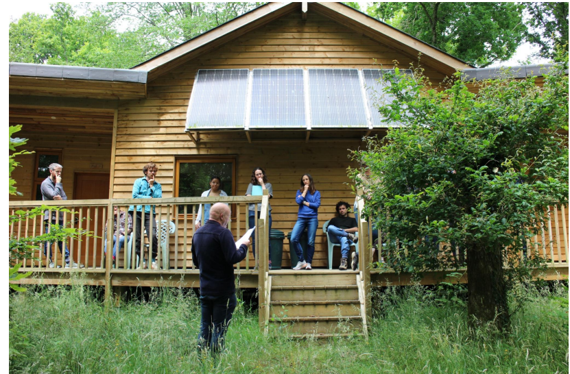
Gathering on the deck of the Hideaway to hear a vision for the future

Our newest accommodation building, the Hideaway is now fully operational and we are pleased with the positive impact it is having on the groups we can host at the wood. Having a larger set of high-quality, more accessible rooms means we can attract a wider range of groups with different needs.