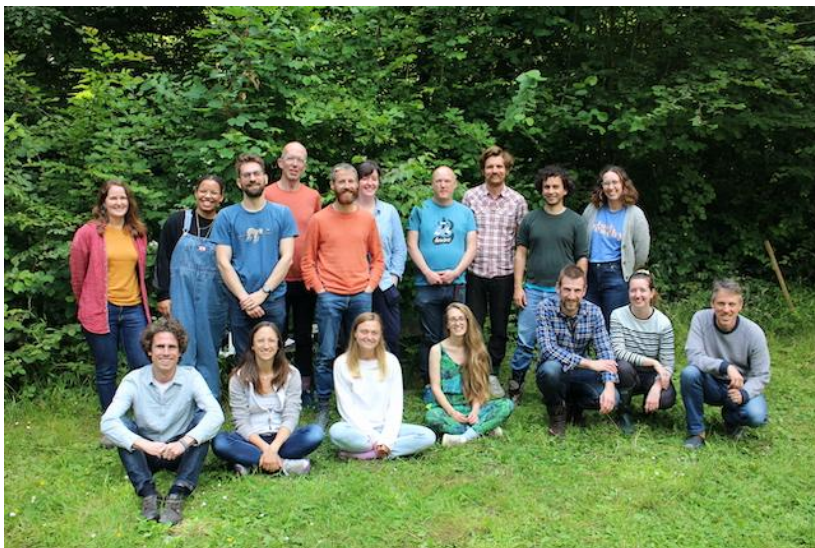
Participants at the Regenerative Design Lab, hosted at Hazel Hill