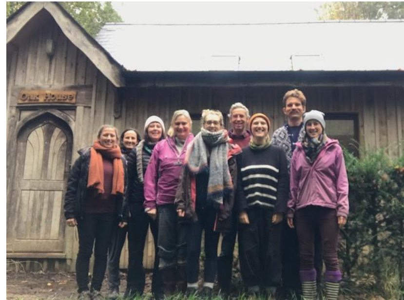
Staff and trustees gather outside the Oak House

The four trustees we recruited in 2021 are now fully embedded in operations. We continue to develop our management approach of a self-managing team, with trustees and staff collaborating to form working groups. This higher level of trustee engagement is helping to build the resilience of our operation.