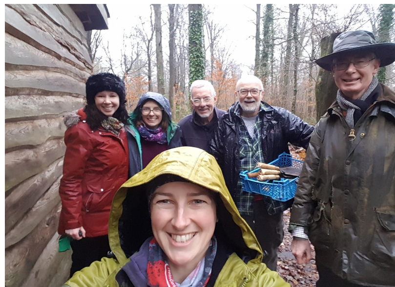
An autumn gathering of some of our volunteers

Our volunteer community continued to be a vital part of Hazel Hill, taking care of the woods and our facilities. Their efforts are central to maintaining the charm and functionality of Hazel Hill as a retreat centre. Volunteer retention is high - some of our volunteers have now been with us for 5 years, which is amazing. We celebrate Volunteers' Week in June, giving volunteers handmade personalised cards saying thank you and celebrating the length of time they have spent volunteering with us.