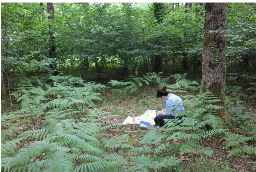
A participant at a wood event re-imagining the future while emerged in the wisdom of the forest