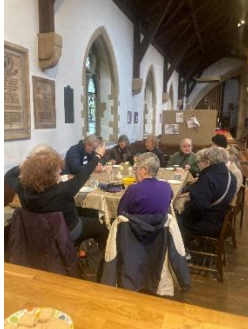
Places of Welcome – Monday morning coffee at All Saints Church

Monday morning coffee (Places of Welcome) at All Saints is a lovely, gentle and friendly way to start the week. It provides a happy meeting place for anyone who would like a chat and a good mug of coffee and biscuits (and often home-made cake!) There are often up to 20 of us joining together between 10.30am and 11.45am.