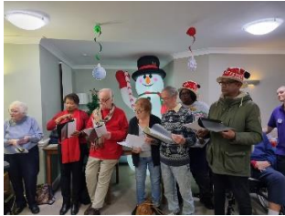
Parkside Residential Home for their Christmas Carol event

communion and a few hymns. We also attend to the dying at Florence House, offering prayer and comfort to both the resident and often their families. We are joined by residents who can come to a main room to worship together, but we also go into individual rooms to those unable to leave their rooms. The numbers joining us have remained steady throughout the year. We were lucky enough to be invited to attend and lead on special occasions such as the Christmas gatherings and fun days in the summer (see below).