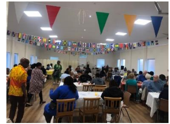
Right – Caribbean evening at St Mark's Hall

Our ministry team continue to visit our residential care homes – an important part of our parish with a huge impact not only on those in the care homes, but also a feeling of worth to those undertaking this part of our mission and outreach. Thank you to all who continue to offer their time for this important part of our parish.