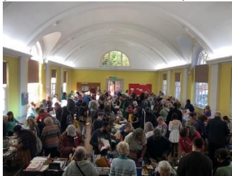
Left – Jumble sale at All Saints Hall

We remained busy with our fundraising efforts over 2024, supplementing our income as well as providing lots of fun and community outreach. Our events are important for the parish and our community – not only showing people we are here, but offering events that welcome people into our space and offer them a reason to join us. Our events included jumble sales, parish fairs, charity events throughout the year, a joyous caribbean evening and our Christmas tree festival. We also repeated our Lent quiet day at Douai Abbey which was reflective day, enjoyed by all who attended. It is lovely to create opportunities in the parish to deepen friendships and get to know our fellow parishioners on a deeper level.