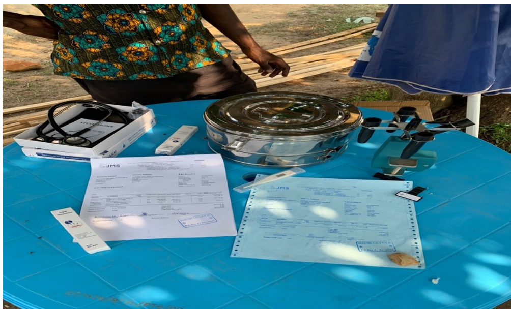
Steriliser, cylinder, glucometer, thermometers, and stethoscope.

The images below show the arrival of the equipment at Kihembe Health Centre II: