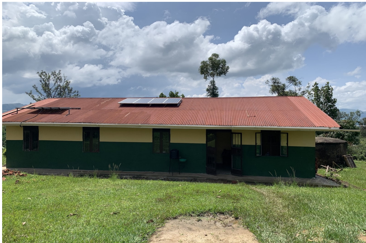
Outside of the health centre on completion of the renovation project.