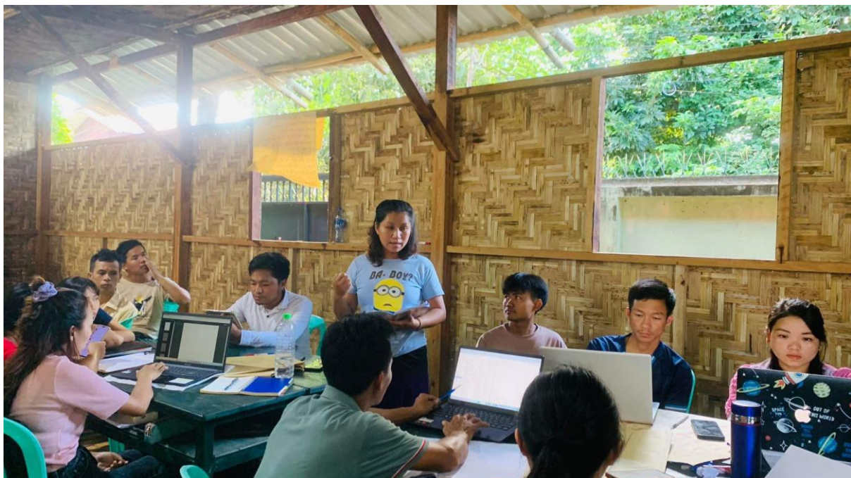
Teacher training at NSi

The Tekkatho Foundation supports this programme by providing access to the eTekkatho MyLibrary and leading weekly teacher training sessions. This work forms part of our broader commitment to strengthening non-government adult education in Myanmar's border regions.