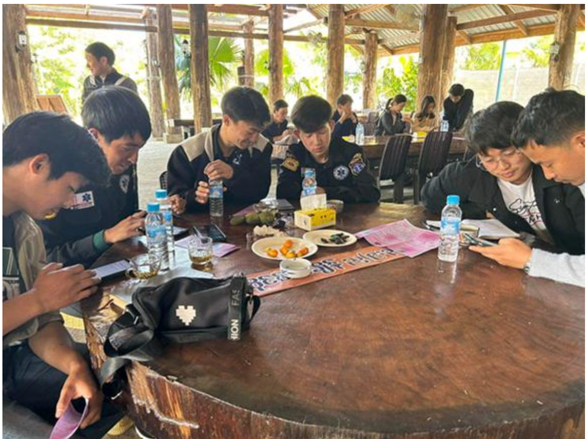
First responders from the Lisu Youth Community Rescue Team using MyLibrary in Putao to build their first aid skills.

We pack our digital MyLibraries with medical and health resources specifically for locations where there is limited or no access to medical professionals, along with guides covering topics such as sanitation, helping those with disabilities, and care for pregnancy and birth.