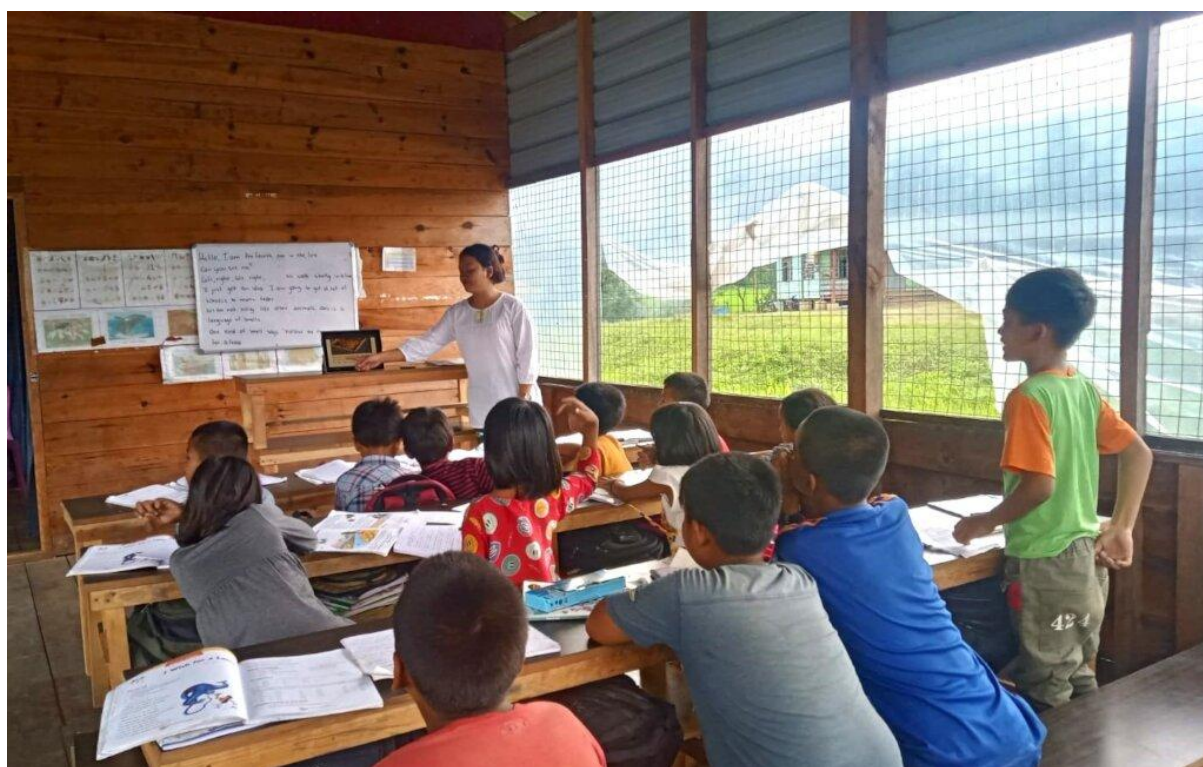
English language lesson at the new school in Cikha

Through Raise a Hand , we have set up learning hubs at two of these community-run schools. Each hub is powered by an off-grid, self-contained eTekkatho MyLibrary, offering thousands of digital educational resources for learners of all ages.