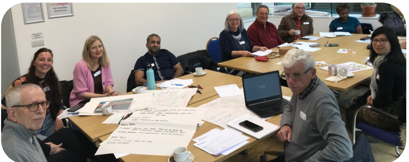
Trustees, Staff and our Advisory group at our Annual Planning day in February.

In the coming year this group will be a key driver in our development. We are really excited to see how it develops and to learn from the experience of those with lived experience of seeking sanctuary."