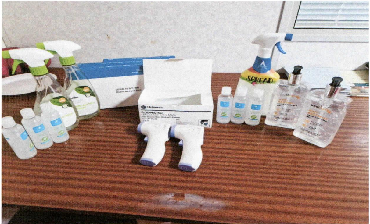
PHOTO BELOW SHOWING TEMPERATURE RECORDING EQUIPMENT AND FACE MASKS & CLEANSING SOLUTIONS

PHOTO BELOW SHOWING TEMPERATURE RECORDING EQUIPMENT AND DISINFECTANT & CLEANSING SOLUTIONS