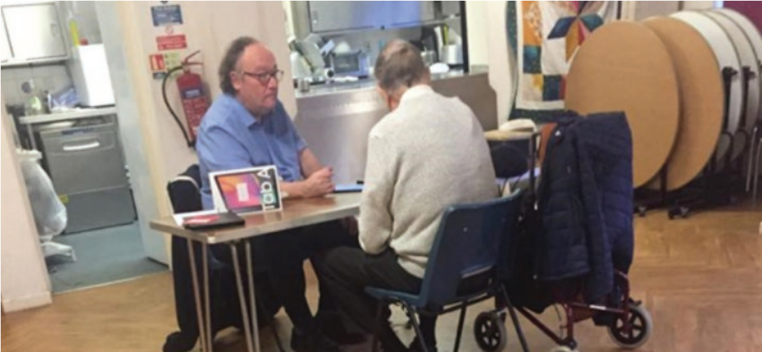
One of our members taking part in a session at our St Margaret’s centre.

Since the pilot ended, we have continued to support members in The Royal Borough of Kensington and Chelsea as well as Westminster. The feedback we have received from DigitALL participants is overwhelmingly positive, with many members going on to take part in other Open Age activities.