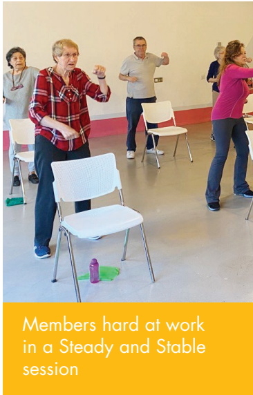
Members hard at work in a Steady and Stable session