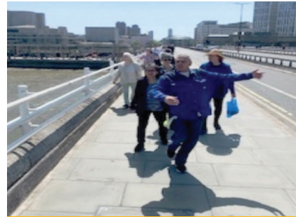
Walking to The Royal Opera House ahead of a free recital