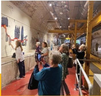
Exploring the underground train at The Postal Museum