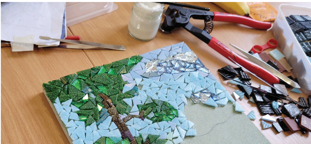
A mosaic masterpiece