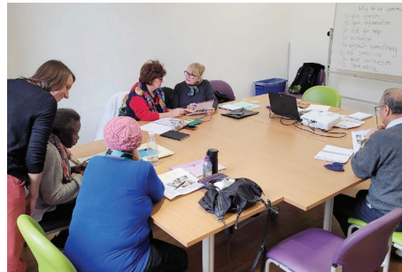
Speaking English with Confidence course at the Second Half Centre