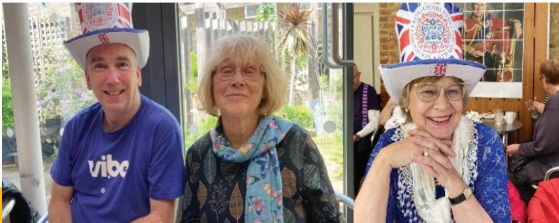
His Majesty's subjects

Our members enjoyed parties fit for a king as they celebrated the coronation of HRH King Charles III. Some even made their own hats!