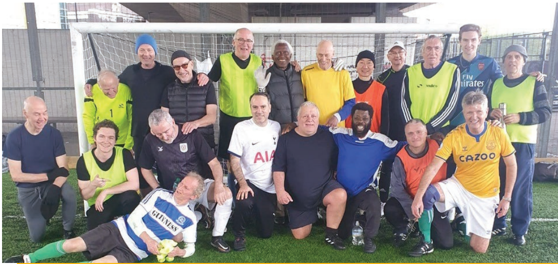
Members of the Men's Space Walking Football team

of Men's Space members are now taking part in two or more Open Age activities a week.