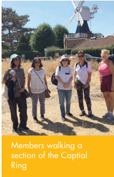
Members walking a section of the Capital Ring