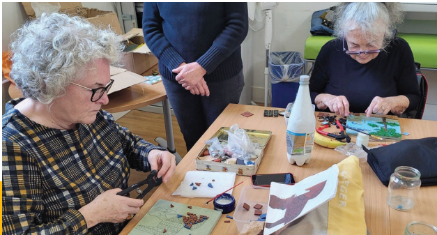
Members feeling creative in a Mosaics class