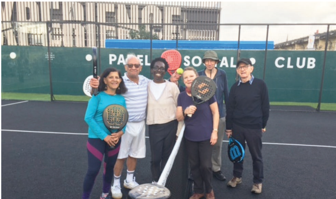
Members trying their hand at Padel

This year our members were invited to try their hand at Padel, a type of tennis originating in Mexico, and afterwards attend the BBC Earth Experience. It was a brilliant day for everyone who took part. Our thanks go to the Earls Court Development Company for making this opportunity possible.