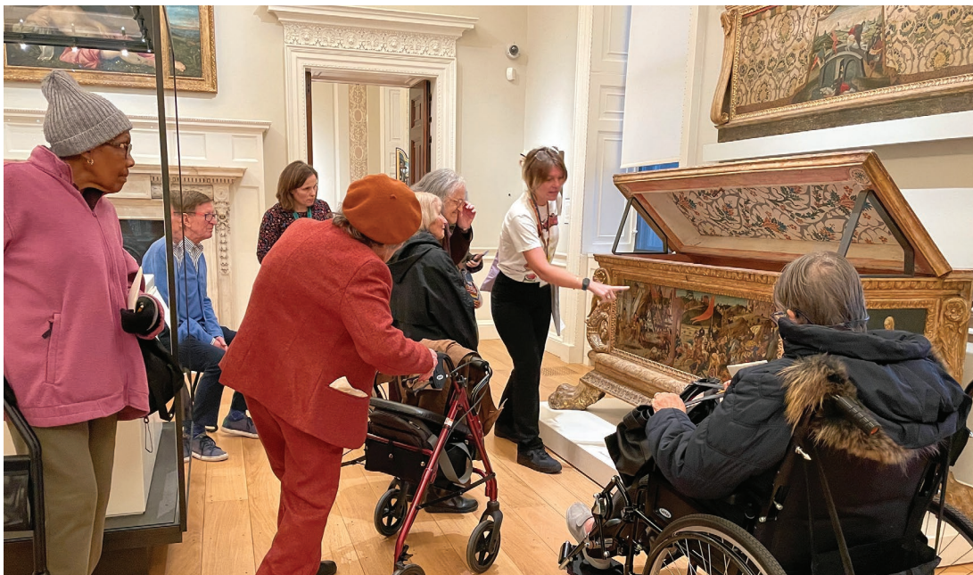
Phone group members visiting the Beyond the Streets exhibition at the Saatchi Gallery