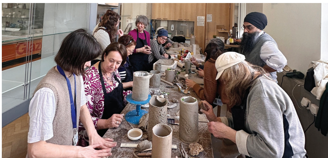
Time for Me members enjoying the members-only ceramics session at the V&A