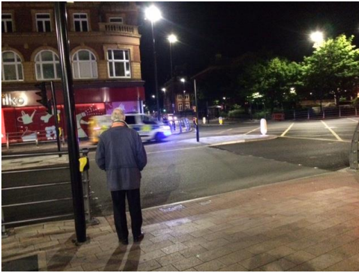
Police van passes deserted streets near Wilko lights

HARTLEPOOL TOWN PASTORS have again been furloughed for the entire year under review. The reason is obvious – the Covid-19 pandemic and corona rules and restrictions. For most of the year, the night-time economy of Hartlepool has been either closed down or severely restricted and the street presence of the 'Angels' in the early hours in the town centre has been missing ... now returning cautiously with Hartlepool's hospitality venues.