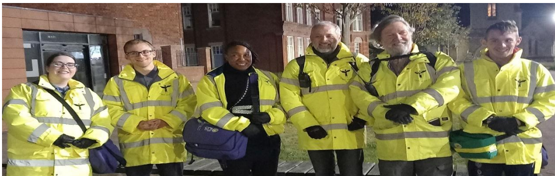
ON PARADE: kitted out in badged high-viz jackets, our teams - two three-handers here - ready for night patrol.