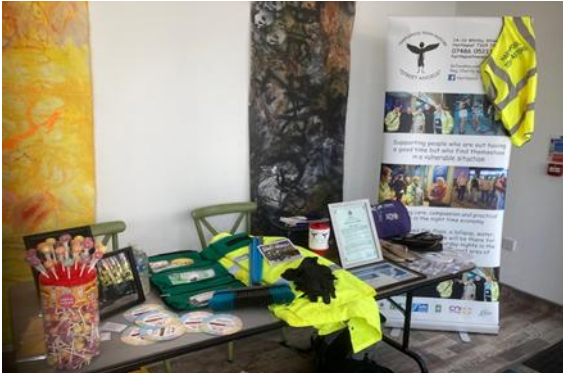
FIT TO GO, HTP's display stand at freshers' day

We linked arms with new partners Lilyanne's, first teaming up in December 2023. The street angels also maintained contact with parent organisation, Redeeming Our Communities (ROC) to which HTP now makes a financial contribution towards running costs.