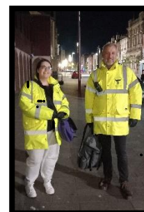
STREET SCENE: our friendly faces are welcoming

These organisations include the churches in Hartlepool, the police, representatives of Hartlepool Borough Council, councillors, licensees, door staff, CCTV operators and generous public out and about in Hartlepool's night time economy. Without their support and co-operation, the work of Hartlepool Town Pastors / Street Angels would not be possible.