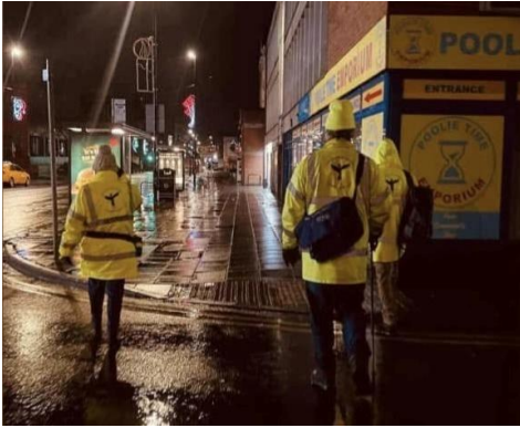
NO STROLL IN THE PARK: raining here