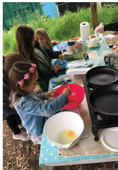
Figure 1 Family Bushcraft

Regular sessions have provided support, skills development, and social contact to vulnerable and often isolated adults.