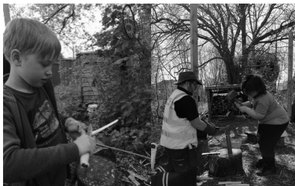
Figure 4 Family Activities at Wakefield Road

Fallout from lockdown is ongoing, with families wellbeing being challenged and the need to socialise and gain support from peers increasing; families told us they have been struggling. We have also been told of financial deprivation within the home education community. An underlying theme of feedback gained from this group is that children have not been out, spending their days indoors, with parents keen to change this. Lockdowns have changed routines, leaving many families missing out. This