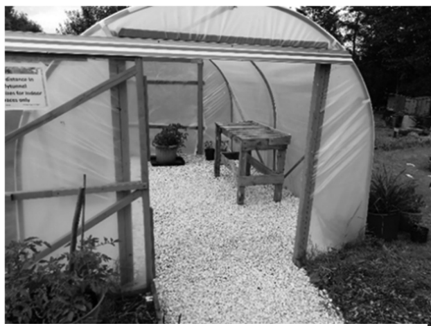
Figure 2 Wakefield Road Polytunnel improvement

In response to the pandemic improvement works at Wakefield Road were expanded and accelerated to ensure that the charity could offer Covid safe outdoor space for GW projects and to offer to the local community. A gravel base has been installed inside the poly tunnel to deal with muddy conditions and making the space suitable for a small meetings.