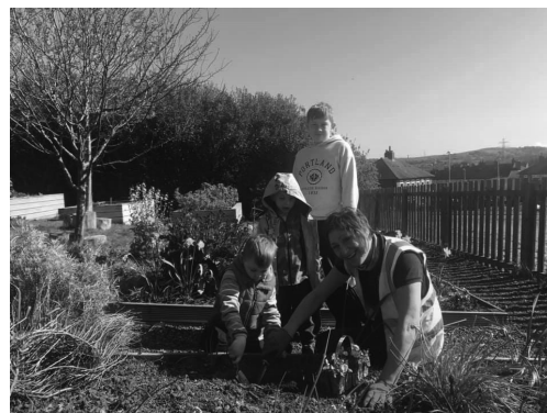
Figure 3 Young visitors enjoying the community gardens