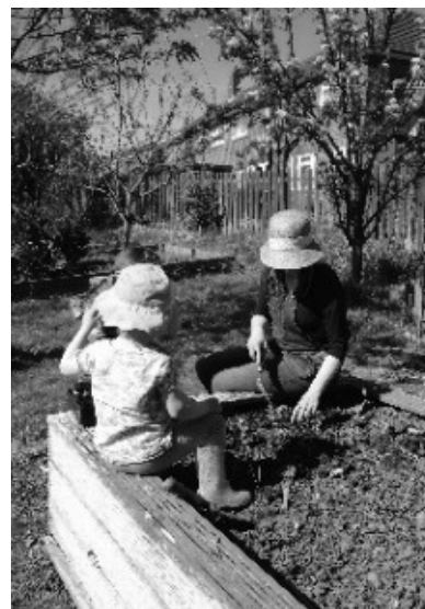
Figure 1 Dalton community garden

It has been a challenging year with the global pandemic hitting the UK in March 2020 and continues to still have an effect on day to day life throughout the year. Growing Works quickly recognised the need to maintain mental health and therapeutic services and has worked throughout the year to provide as much continuity and support as possible to vulnerable and disadvantaged members of the community. The charity has continued adapting to the ongoing changes experienced across society as a result of the Coronavirus pandemic. As restrictions ease through 2021 we have seen the return of our core projects for vulnerable Families, Young People and Adults, and made positive moves to support more people with the introduction of new sessions. Our new offer responds to the increased demand for mental health and wellbeing support in the general population and has seen us delivering sessions to a more open audience as the difficulties brought about by the pandemic have touched everyone in the community.