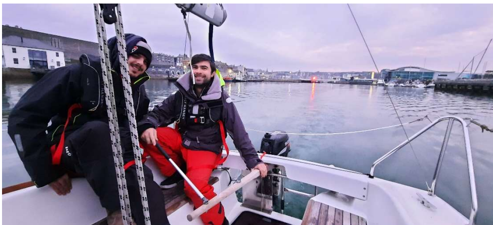
Leaving Dartmouth early morning