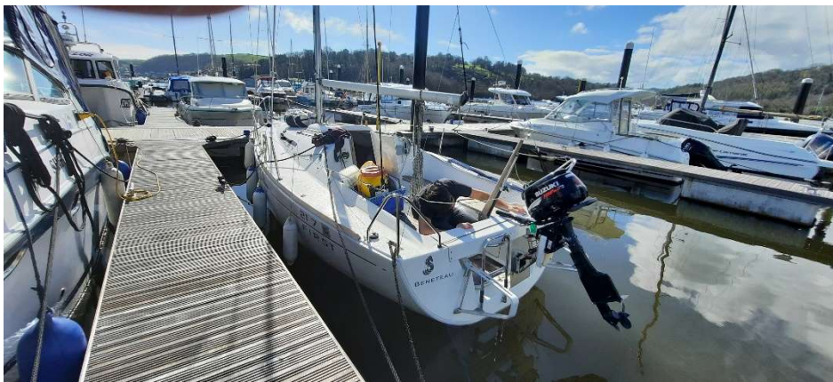
Getting the sails on the boat and rigged ready to leave at first light out of Dartmouth

We sailed the boat from Dartmouth to Mylor at the end of March 2022 with 4 crew including 1 Sailability participant. This was a fantastic passage, stopping at Plymouth overnight. We saw many dolphins and sea birds along the way.