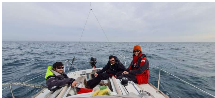
Our passage to Mylor