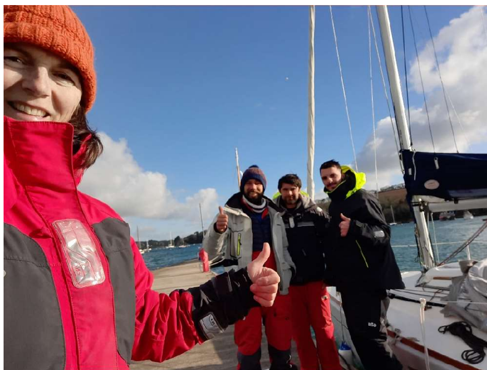
Safe arrival at Mylor Marina and a tired but very happy crew