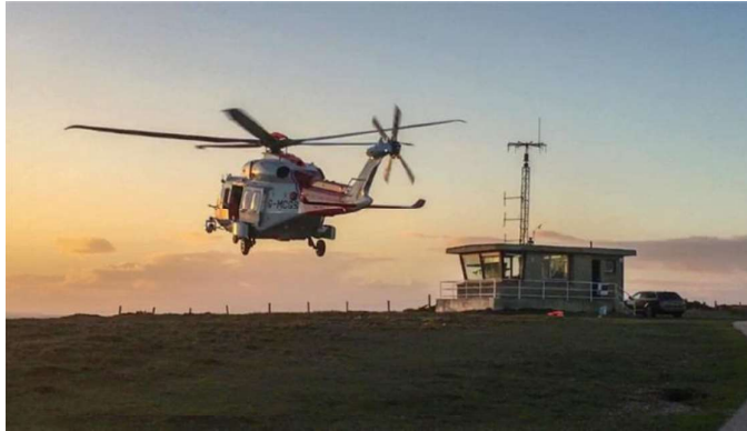
HMCG rescue helicopter at NCI Henaistbury Head