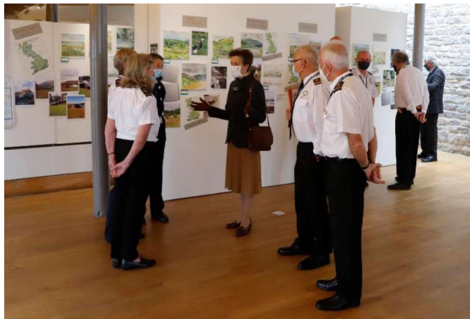
Her Royal Highness The Princess Royal, Royal Patron, National Coastwatch meets watchkeepers from NCI St Alban's Head and NCI Swanage at Durlston Country Park

In June 2021 Our Royal Patron, Her Royal Highness The Princess Royal visited NCI St Alban's Head and NCI Swanage followed by a reception at the nearby Durlston Country Park, meeting many watchkeepers and supporters from both Stations and presenting long service awards. Despite the poor weather the event proved a real highlight for the stations and generated excellent publicity for the Charity.