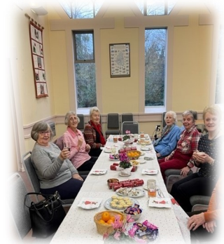
Drop-in members and helpers enjoying Christmas tea.