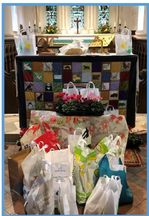
Collections of food bags in the church at the Harvest Service in October

Wickham Bishops Nursery also provided bags of items totaling over 13 kgs of food .