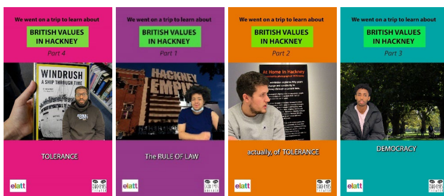
Instagram reels on British Values by PSD students.

The partnership with ELATT entered its fourth year. Odd Eyes' programme supported the curriculum of Functional English Skills and Personal and Social Development classes, as well as ESOL. Bespoke projects designed for the college included: the London Slang Project and the British Values project, both of which involved creating social media content by the students, and the Theatre for Language pilot workshop. The latter laid the foundation for a 12-week course taking place in 2024.