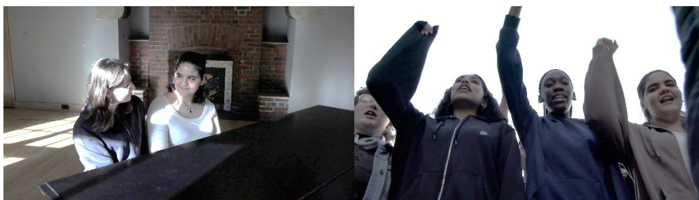
Stills from the short film Change, created in collaboration with Hackney Shed and Sutton House Trust

We were able to deliver the programme thanks to our ongoing partnerships with Hackney Shed, ELATT and secondary schools across London, thus reinforcing existing links and promoting Odd Eyes' unique style in the participatory arts landscape. Moreover, we also engaged with new youth charities and schools. Forming new partnerships with organisations that support vulnerable young women (Ashdon Jazz Academy, Lambeth), young people suffering from isolation (Stuart Low Foundation), refugees and asylum seekers, will allow us to continue to shape this programme according to the experiences of its participants.