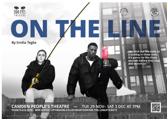
Poster image by Paul Grieve. Design by Max Batty

Despite all the uncertainties coming into preproduction while still waiting to hear from our second funding application to Arts Council England after the first was rejected, Odd Eyes Theatre managed to complete a very successful tour of On The Line with 16 dates. The On The Line tour performed at Camden People's Theatre (Camden), Stanley Arts (Croydon), VAULT Festival (Peckham) and in secondary schools and college in 6 London boroughs.