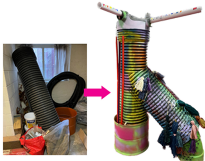
Rebuild Site Project

Studio Focus is our weekly applied arts programme for adults with learning disability and/ or autism. These are highlights from the studio in the last year.