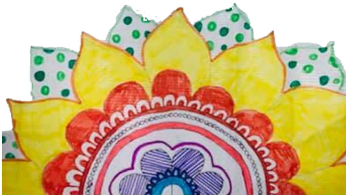
Drawn by one of our 11+ bereavement support group participants.