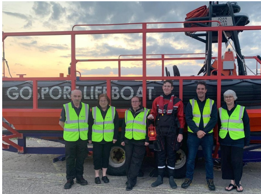
D-Day Memorial Lantern event, 6 th June 2024