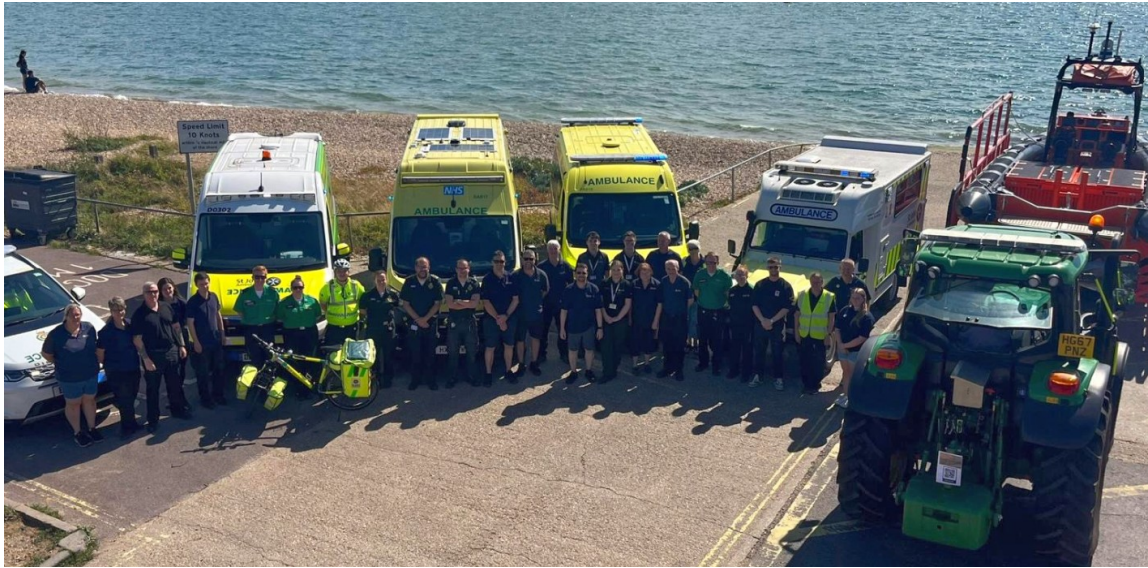
GAFIRS Emergency Services Day, 21 st July 2024

Apart from running our own very successful New Year's Day Dip and Emergency Services Day, we also attended fundraising and educational events including Gosport Marine Festival, St Vincent College's Summer Festival, HMS Collingwood, Kings Group Academy Bay House Community Activity Day, HMS Sultan Families Day, Daedalus 80, Alverstoke Michaelmas Fayre, Elson School Fete and the Clipper Round The World Yacht Race homecoming.