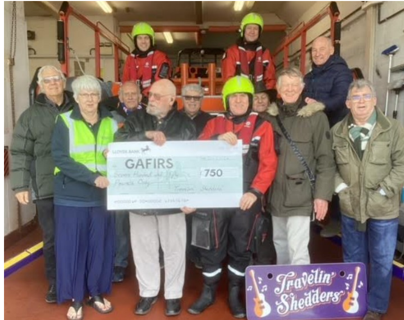
Cheque Presentation from The Travlin' Sheddars - 21 st January 2024