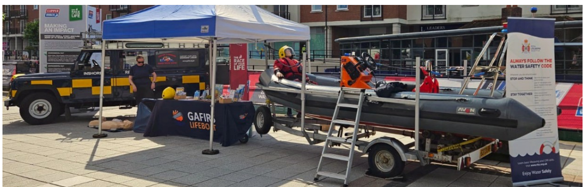
Clipper Round the World Yacht Race Homecoming – 26 th - 28 th July 2024