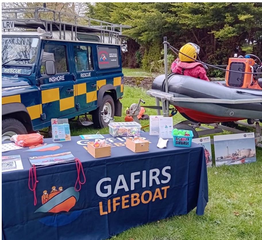
Gosport Marine Festival – 18 th May 2024

Apart from running our own very successful New Year's Day Dip and Emergency Services Day, we also attended fundraising and educational events including Gosport Marine Festival, St Vincent College's Summer Festival, HMS Collingwood, Kings Group Academy Bay House Community Activity Day, HMS Sultan Families Day, Daedalus 80, Alverstoke Michaelmas Fayre, Elson School Fete and the Clipper Round The World Yacht Race homecoming.