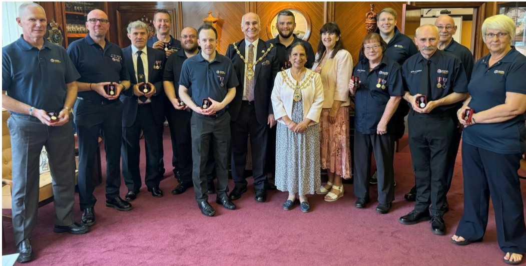
Members receiving the King's Coronation Medals from the Mayors of Gosport and Fareham

People: all our directors and members are unpaid volunteers who receive no remuneration or expenses for routine training, support, or operational activities, including attendance at emergency callouts. Our members may be reimbursed for expenditure incurred on exceptional activities, such as travelling outside the local area on GAFIRS business. Our 61 active members gave 9,813 hours of service this year. Of the 61 members, these include boat crew, shore, and cadets. In 2024, 15 members were awarded the Kings Coronation Medal. One cadet was awarded the Young Citizen of Gosport award, and 15 members were awarded with RLSS Honours and Merit Awards.