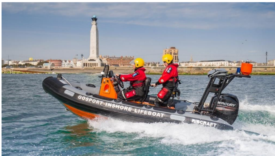
Gosport Inshore Lifeboat, the Ian Fuller, on patrol off Southsea.

As part of our strategic management process to maintain our enduring capability and continuity of service, we conduct regular reviews of our boats and vehicles to ensure they remain fit for purpose and to enable us to plan for their timely replacement.