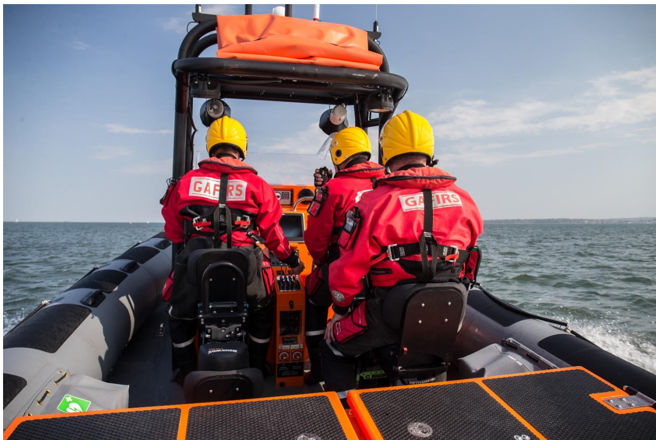
Gosport Lifeboat on patrol in the Solent.