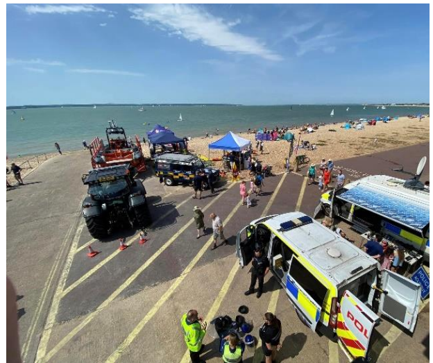
GAFIRS Emergency Services Day, 17 th July 2022.