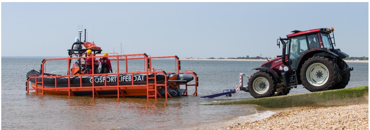
Gosport Lifeboat launching on routine patrol.