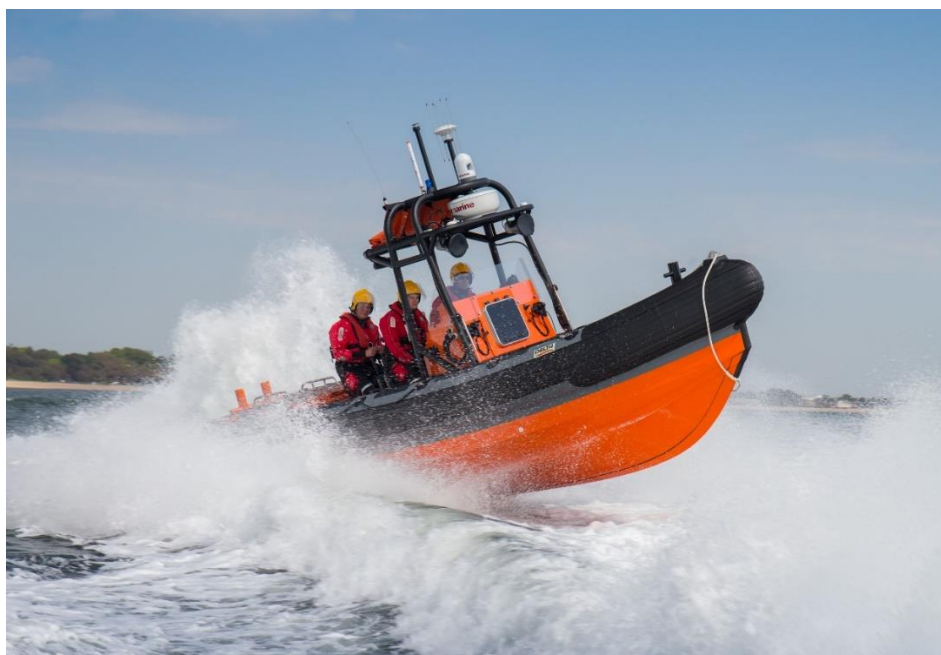
Gosport Lifeboat, the Joan Dora Fuller, at speed in Stokes Bay.

This chart, taken from our D4H management system, shows the location of our 135 incidents in 2022. (Note that due to its nature, one incident is recorded at two locations above.)