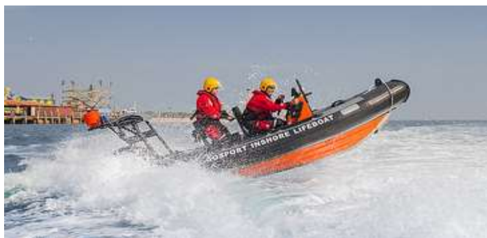
Gosport Inshore Lifeboat at the entrance to Portsmouth Harbour.

The Directors are satisfied that the identified risks are properly managed and that adequate risk mitigation is in place.