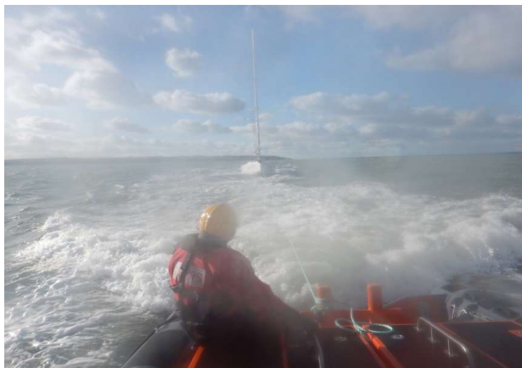
Gosport Lifeboat towing a casualty vessel to safety.

The second year of the COVID-19 pandemic again severely reduced our sea-safety and community talks activity but we were able to restart our programme and in fulfilment of our objective to educate the public in water safety, we provided 2 sea safety talks to 71 children and 12 teachers/leaders from local schools and youth groups during the year, together with 5 talks to 131 adults. The talks given to children focus on sea-safety, with the talks given to adults including coverage of the work of GAFIRS, the SSRO and HM Coastguard in sea-safety.