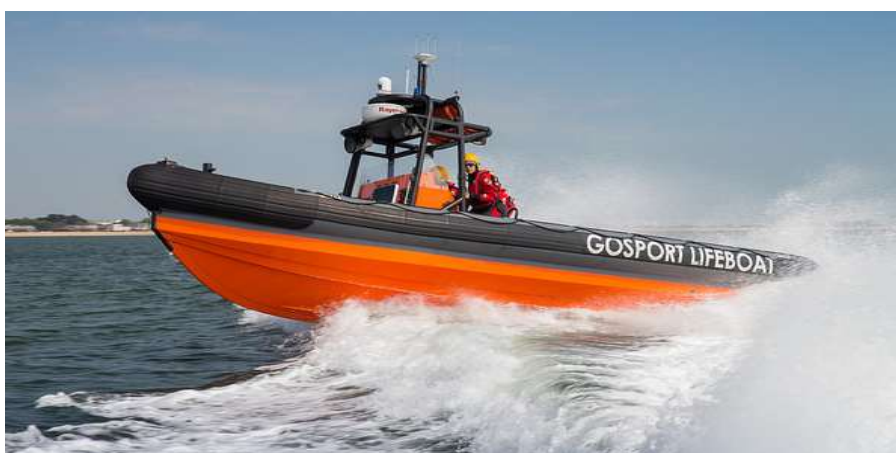
Gosport Lifeboat in Stokes Bay.

GAFIRS operates under Articles of Association as amended by special written resolutions on the 14 th August 2014.