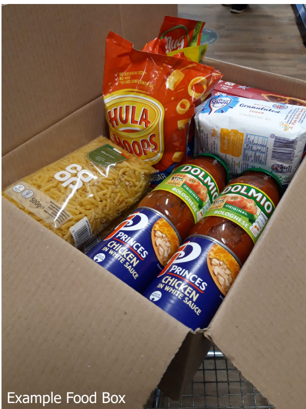
Example Food Box

- Rosie, Leighton Linslade Homeless Service