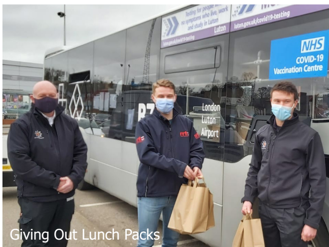
Giving Out Lunch Packs

150 lunch bags were provided to three COVID-19 vaccination centres across Luton.