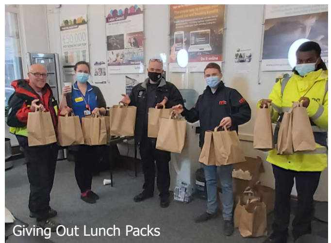
Giving Out Lunch Packs

For more information about RRT, please visit https://rrtglobal.org/gb/ .