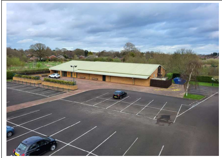
The Gospel Hall at Westward Ho, Grimsby

A central aspect of the Trust's mission, aimed at fulfilling its objectives, is the provision of a platform to coordinate outreach endeavors within the wider community in and around North East Lincolnshire