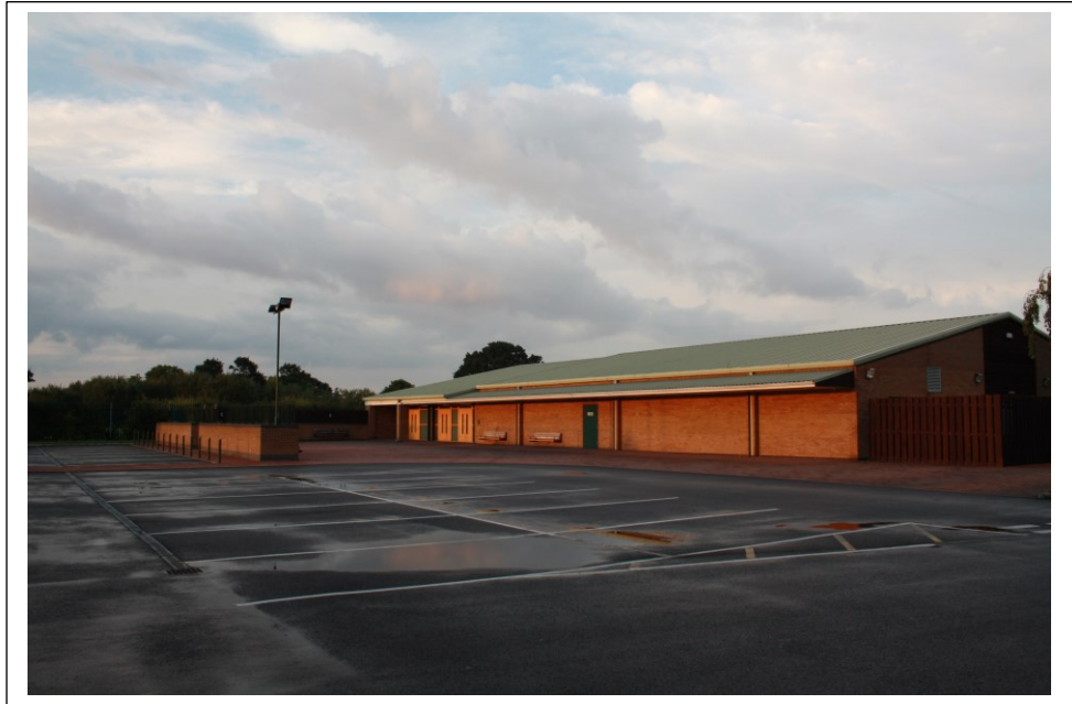
The Gospel Hall at Westward Ho, Grimsby

One of the Trust's principal activities that furthers its objects is providing a facility for the coordination of "outreach" work into the wider community.