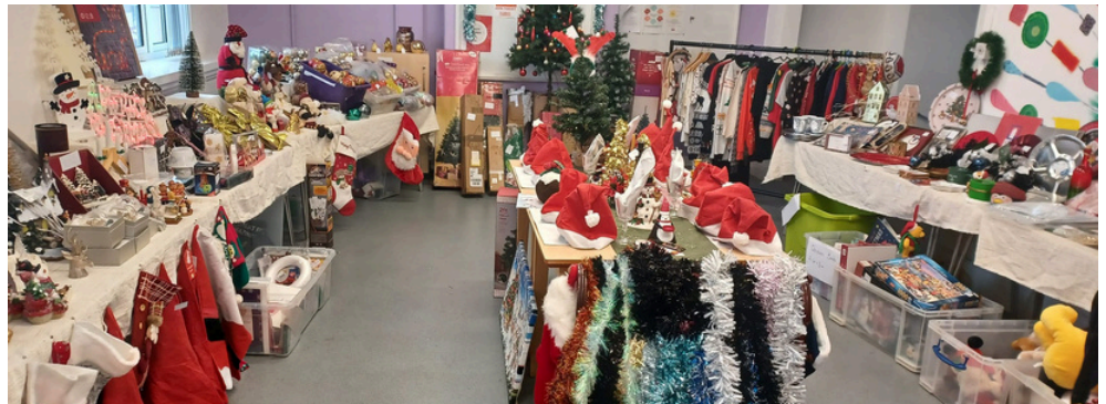
3 day winter wonderland sale