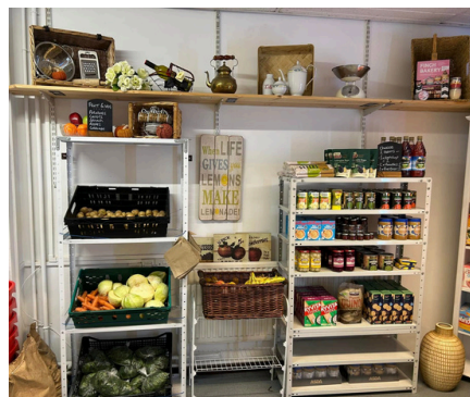
Good Stuff Supermarket