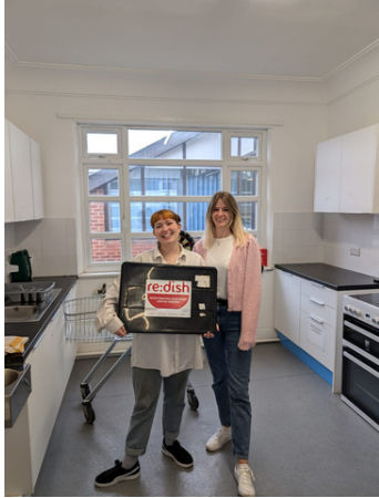
Sector 3 helping with a Spring Clean