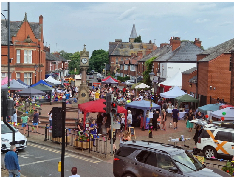
Reddfest July 2023