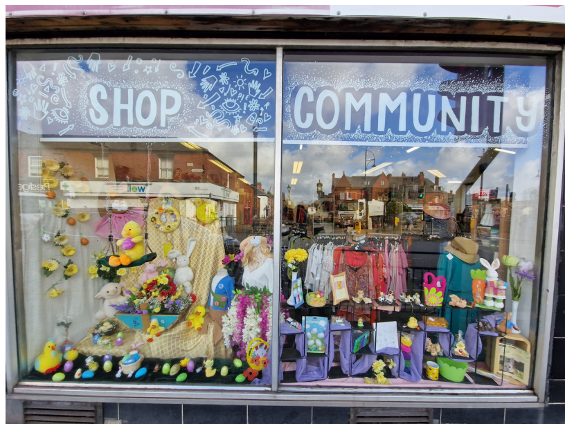
New window artwork and a fantastic Easter display