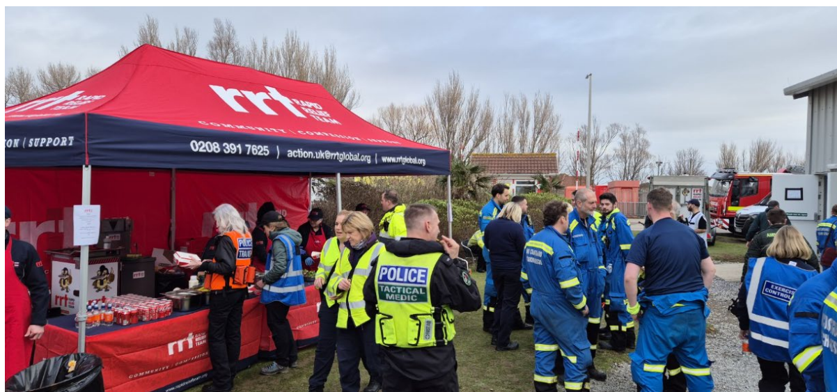
Photo of Major Incident Training event at Butlins

4 th February 2025 – Donuts served to NHS staff at Musgrove Park Hospital in recognition of World Cancer Day