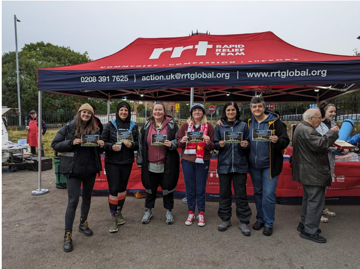
Supporting the Whitechapel Centre Homeless Sleepout event.

From April 2023 – April 2024 Liverpool RRT provided 16,900 free meals at 21 different events, supporting Merseyside Police, Merseyside Fire & Rescue Service, The Whitechapel Centre, The Hope Centre, The Victory Outreach Church, Riverside College & Cancer Research UK. As well as multiple NHS hospitals – Broadgreen, Alder Hey, The Royal, Aintree & Fazakerly.