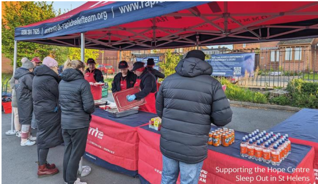
Supporting the Hope Centre Sleep Out in St Helens