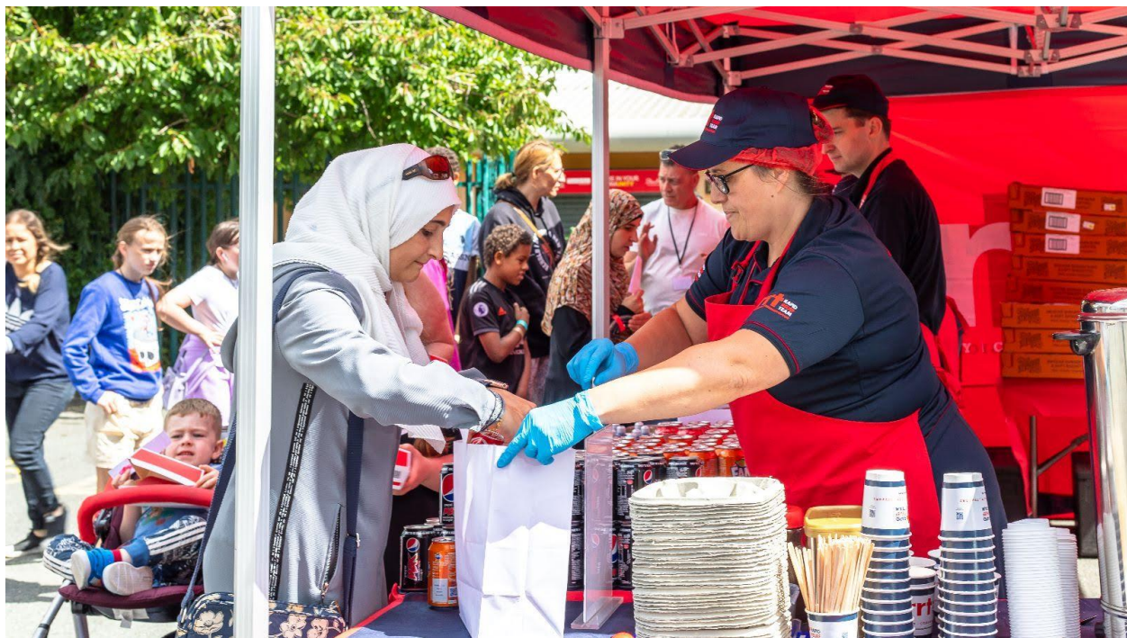
Supporting the Kirkby C Of E Primary School Victory Outreach day