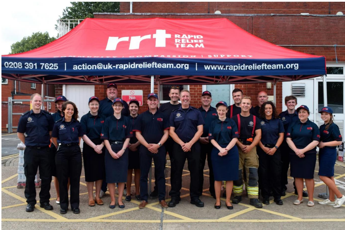
Members of the congregation volunteering through RRT at a previous Fire Station Open Day event

Equipment and trailers are stored in the secure ground of the gospel halls where volunteers can freely access them as much of the work of RRT is done out of normal operating hours.