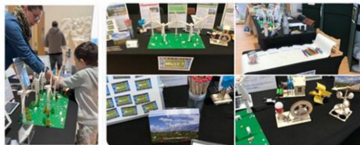
Fig 3. The Festival of Tomorrow display stall

https://x.com/FestOfTomorrow/status/1759152569715249452?s=20