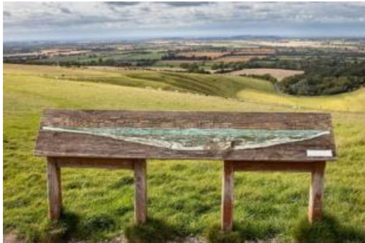
Fig 2. Installed information board