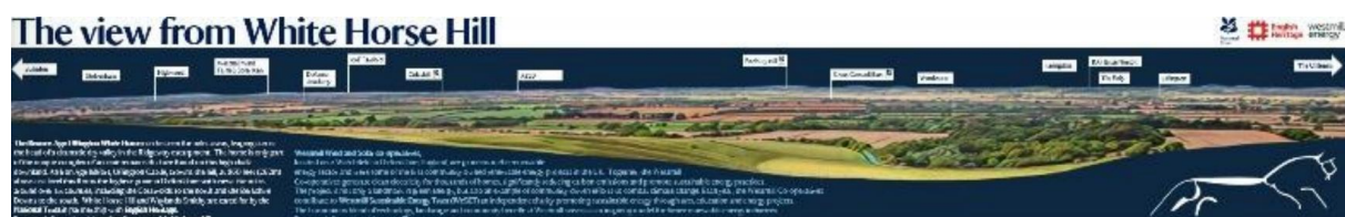
Fig 1. Graphics for installation board

We collaborated with The National Trust and English Heritage to design a replacement for the existing panoramic information board on White Horse Hill to include the wind farm and solar park at Westmill. Both NT & EH approved drafts at the end of 2024, with graphics finalised with printing and installation in 2025. This has been installed next to the much loved and preserved original wooden board.