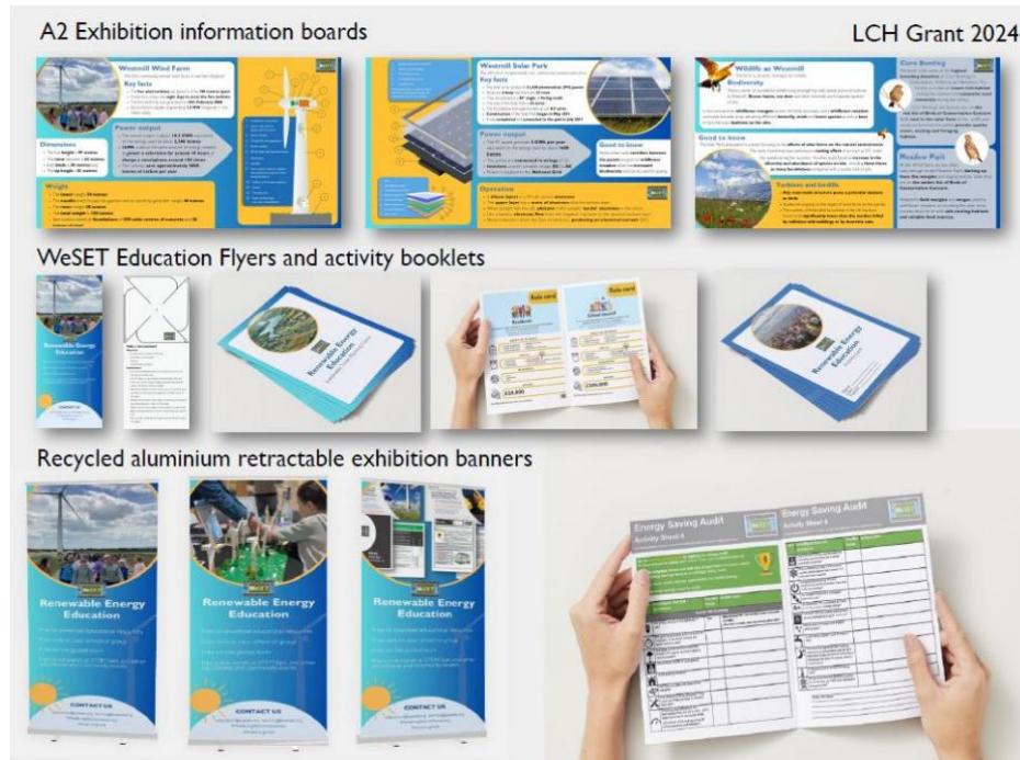
Fig 5. Illustration of promotional materials

In March we submitted successful application for LCH grant for £1,500 (including an application on behalf of WeSET, Westmill Wind and Westmill Solar) to be used for promotional materials specifically for education for use and distribution on visits and at events. These have been designed and with our new website and social media information to be printed in April 2025.