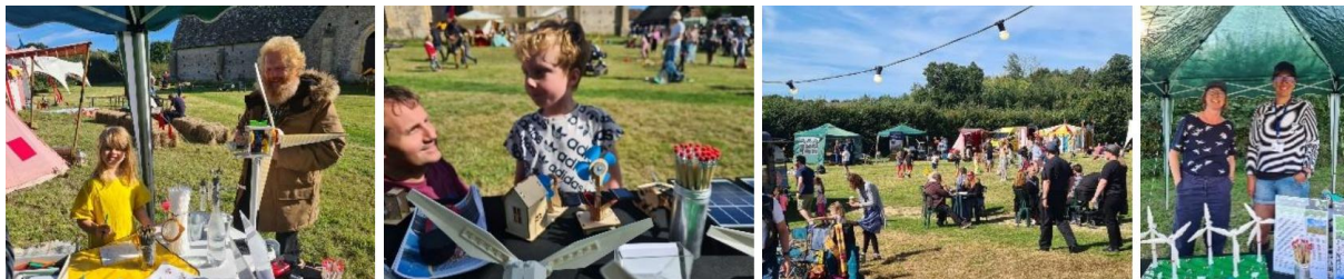
Fig 4. Great Barn Festival event and stall

Footfall was good at this year GBF especially on the beautifully sunny Saturday and we managed to bag an excellent position next to the puppet show and storyteller, so we were able to attract many children and families! We were joined by Energy4all and together we ran a popular pinwheel making activity and made some good new contacts. We had two bookings straight away (1st King Alfreds Cubs Wantage and The Hendreds C of E School) and had several further enquiries after the event.