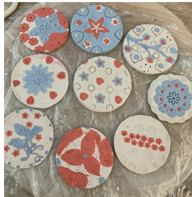
Some of the tiles created

The Beating the Drum team were delighted to contribute to this event, held at the newly built Pavilion on Edmonton Green. We provided a public arts workshop on Iznik pottery-inspired tile-making.