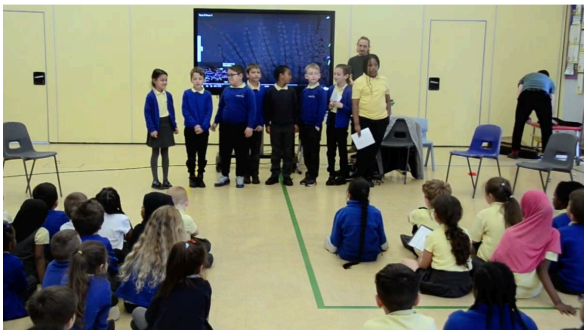
The students introduce their compositions at the concert, which was attended by the whole school, with families and members of the local community

The evaluation concluded, ‘Primary teachers do not often have extensive training in delivering specialist teaching such as music. For the teachers involved, this project was an opportunity to watch something new and inspiring. In addition, they were given access to the project resources so they could refer back to them in other aspects of their teaching. Teachers on the programme reported that they felt more confident in their practice around teaching musical composition, and felt more empowered to teach Turkish cultural history.’