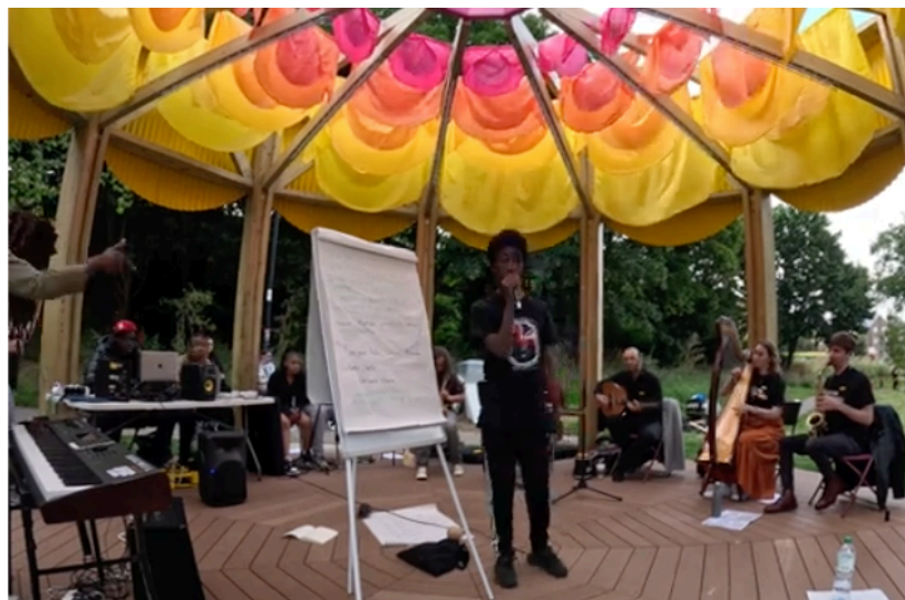
The Anthem is almost complete!

On 14 th July 2024, musicians from the East London Sound Ensemble were funded by the Heritage Fund project to take part with musicians from London Sinfonietta and the DJ & MC Collective in a joyous jam session, expertly facilitated by Aga Serugo-Luco, to create an Anthem to Edmonton.