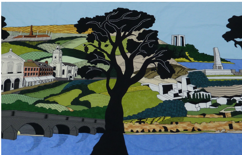
They have become our sons as well