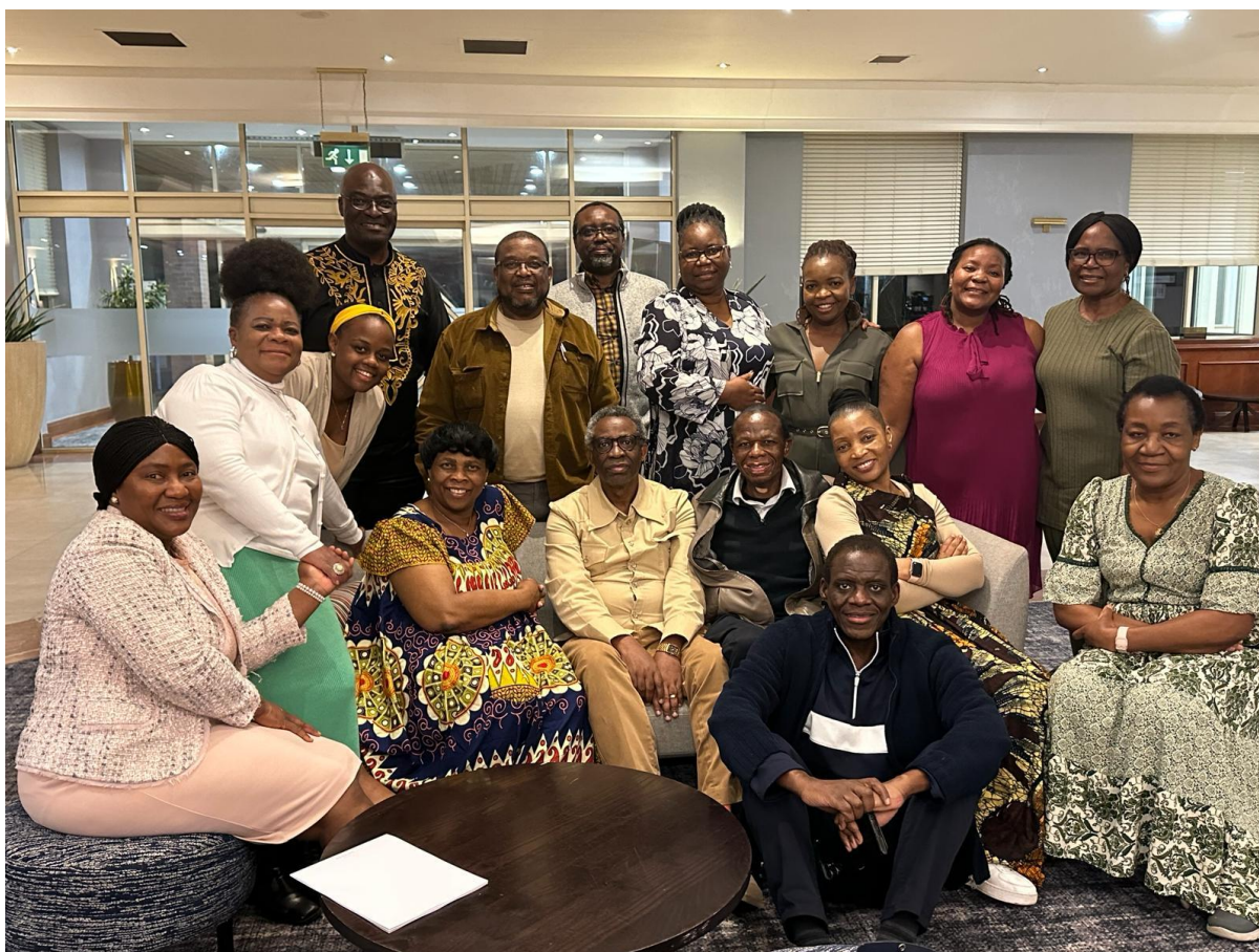
Leadership Training Seminar participants