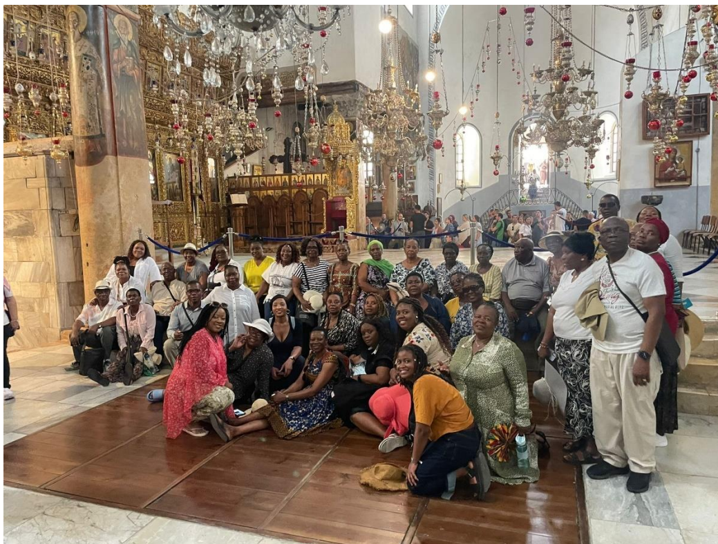
Pilgrims posing for a photo at the birthplace of Christ, Bethlehem