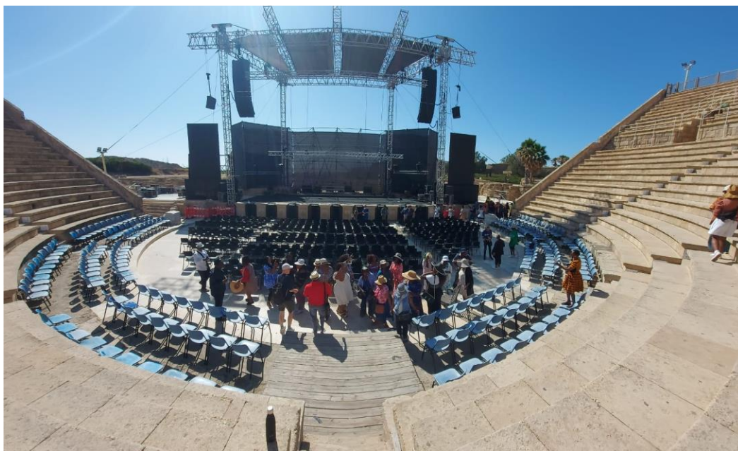
Pilgrims posing for a photo at an amphitheatre in Caesarea