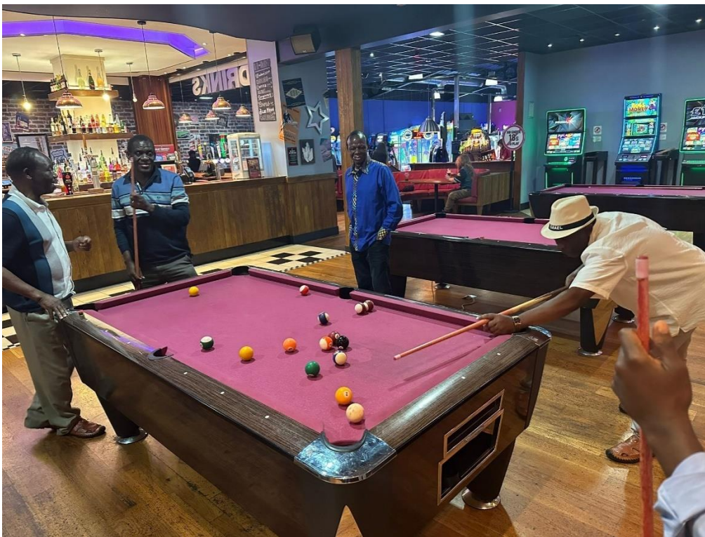
Engaging in soothing pastimes