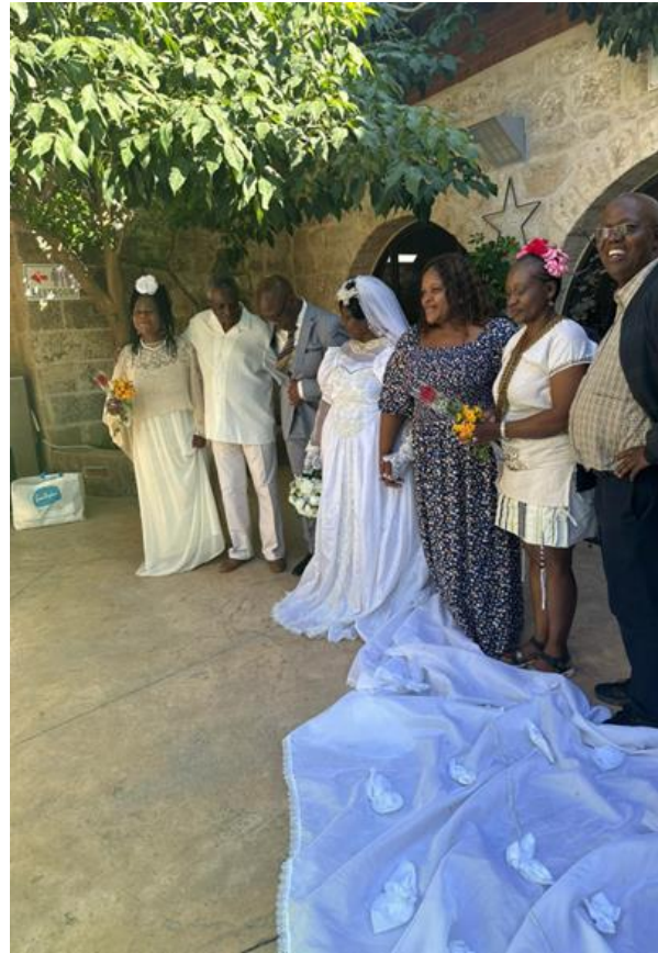
Couples celebrating marriage anniversaries and renewing wedding vows at Cana