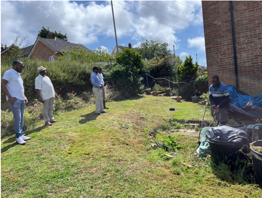
Lending a helping hand - The Men's Fellowship is taking care of baba's lawn.