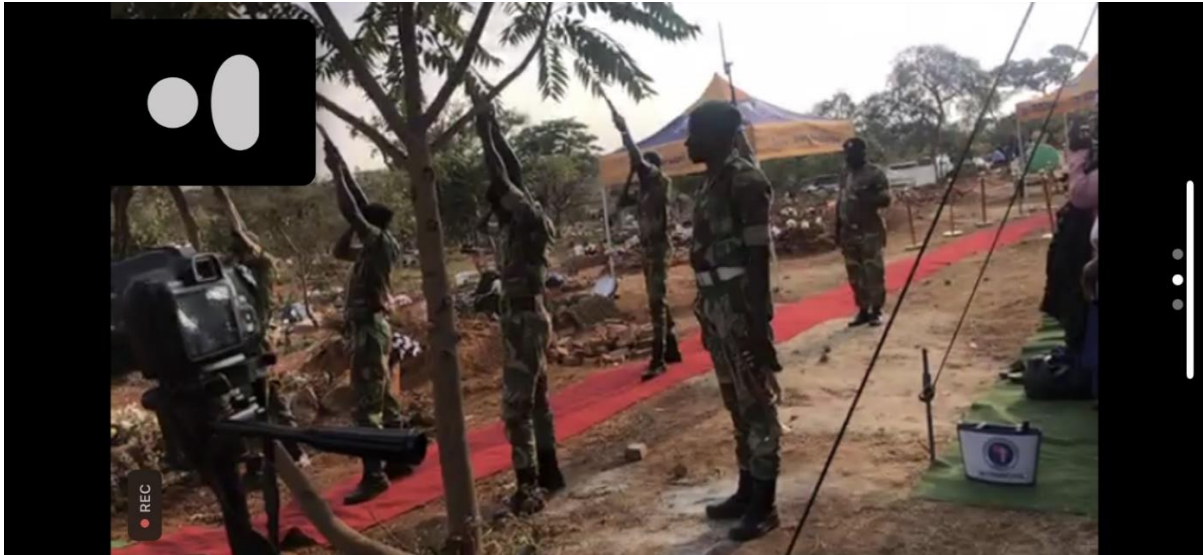
Burial with military honours in Zimbabwe