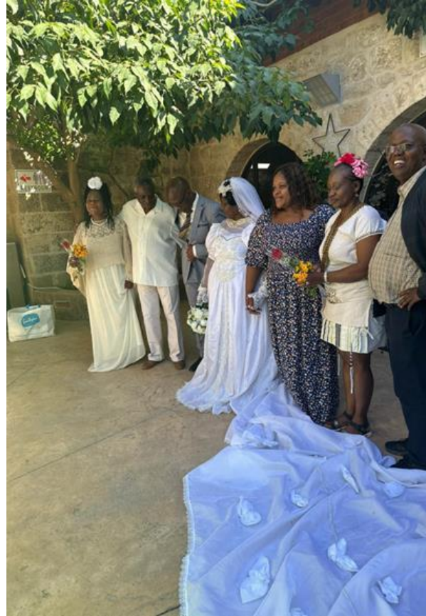
Couples celebrating marriage anniversaries and renewing wedding vows at Cana