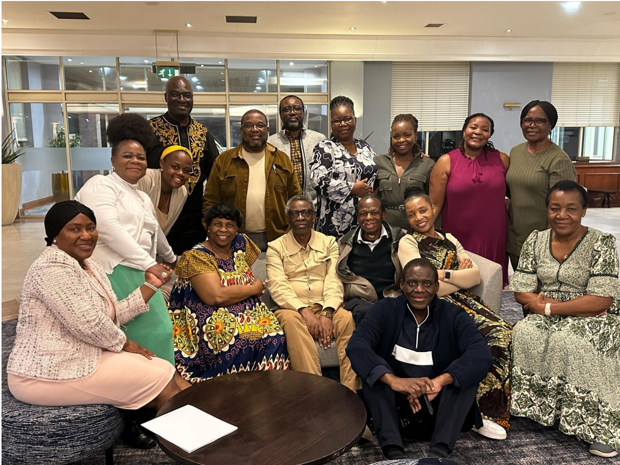
Leadership Training Seminar participants