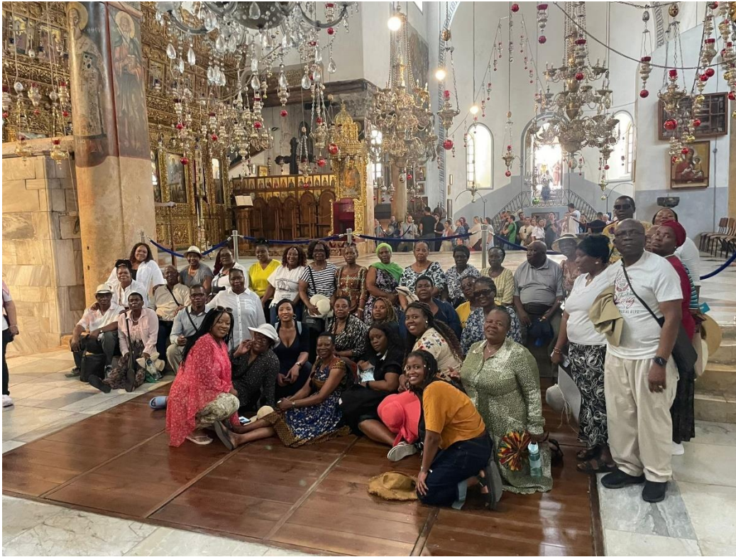
Pilgrims posing for a photo at the birthplace of Christ, Bethlehem