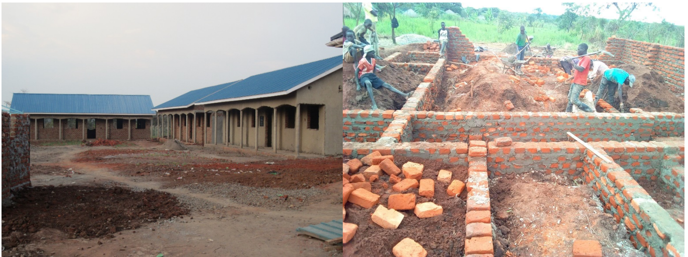
Chrysalis Secondary School, Omoro

CYEN also supported the purchase of a new property adjacent to land owned by Chrysalis in Koro, to safeguard the work in the area and start to develop entrepreneurial activities for young people in the area.