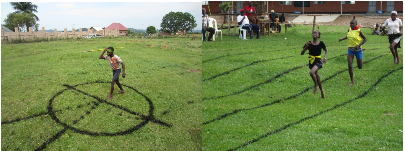
Athletics event December 2020 -