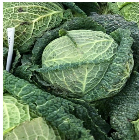
Plenty of fresh food builds healthy families