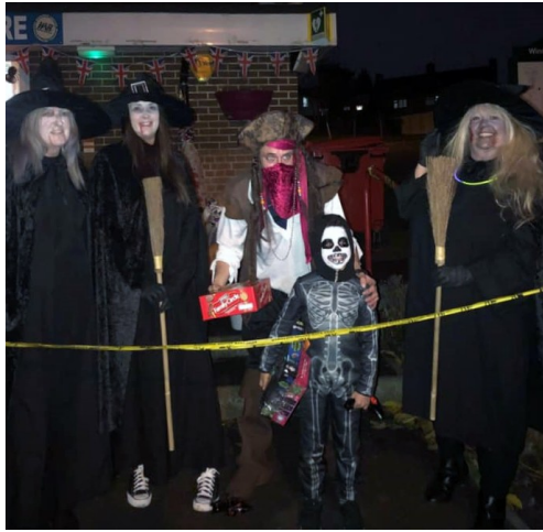
Show us your Scarry costumes and we'll give you a Halloween treat

Everyone needed their spirits lifting, surprise deliveries, take-away foods and distanced social events helped