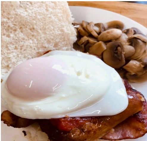
Hot Breakfast take-away was well received!