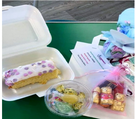
Mums (and Nans) received goodies on Mothers Day