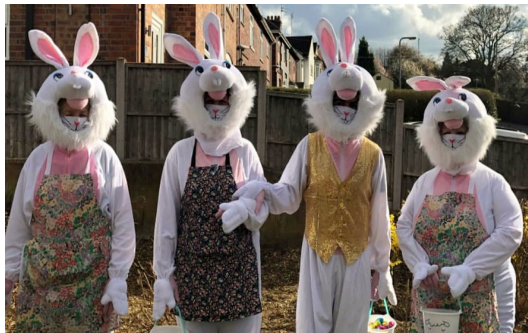
Our easter bunnies handing out chocolate eggs at the school gates