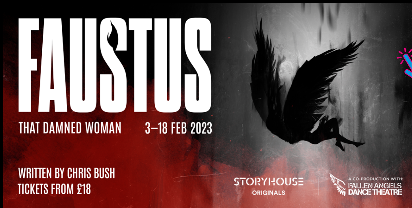
Flyer, Faustus That Damned Woman