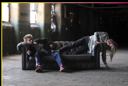
Transfiguration: I Fall.

15 engagement activities - the film and the team reached out within groups of people: homeless, youth, volunteers, students, and professionals.