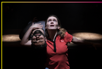
Transfiguration: I Need.