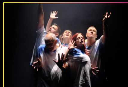
Transfiguration: We Rise.