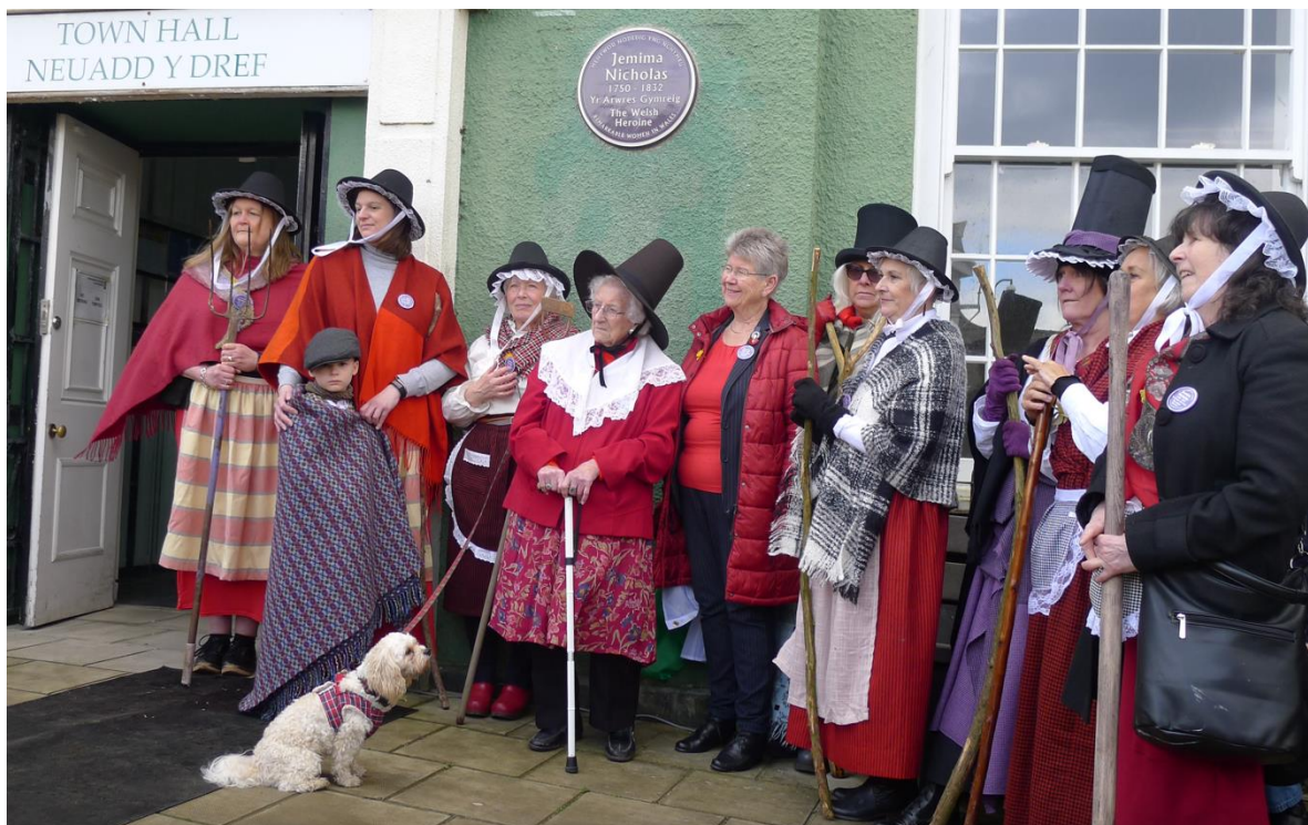
Dathlu Placiau Porffor Cymru - Jemima Nicholas Abergwaun Celebrating Purple Plaques Wales – Jemima Nicholas Fishguard

Mae Archif Menywod Cymru yn hyrwyddo codi proffil menywod yn hanes Cymru a diogelu ffynonellau hanes menywod yng Nghymru