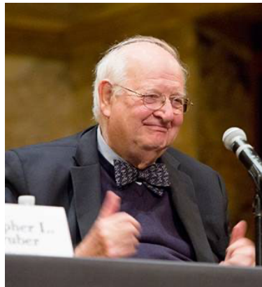
Sir Angus Deaton

Professor Sir Angus Deaton, Nobel Laureate, Chair of the Review.