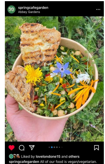
Welcoming Spring Gardens Cafe to Abbey Gardens