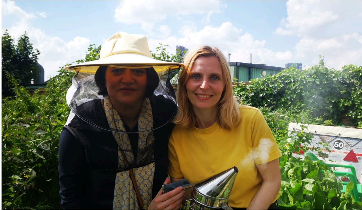
World Bee Day Community Celebration