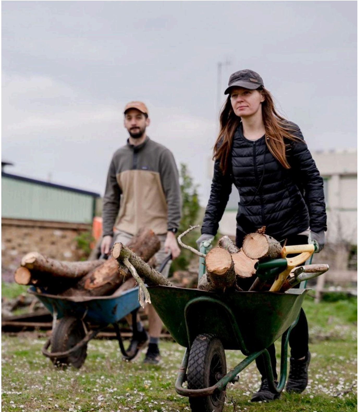
Earth Day Fenceliner Planters