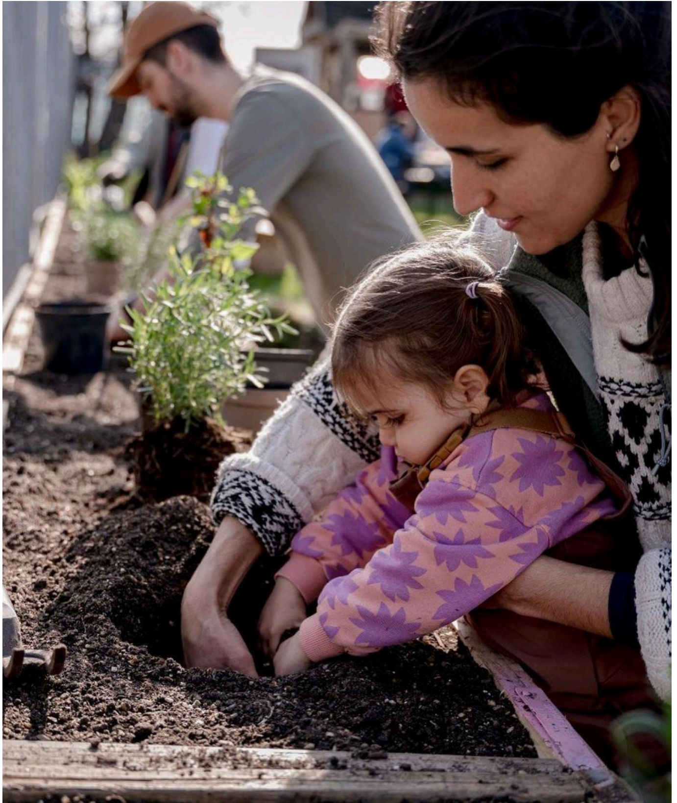
Earth Day Fenceliner Planters