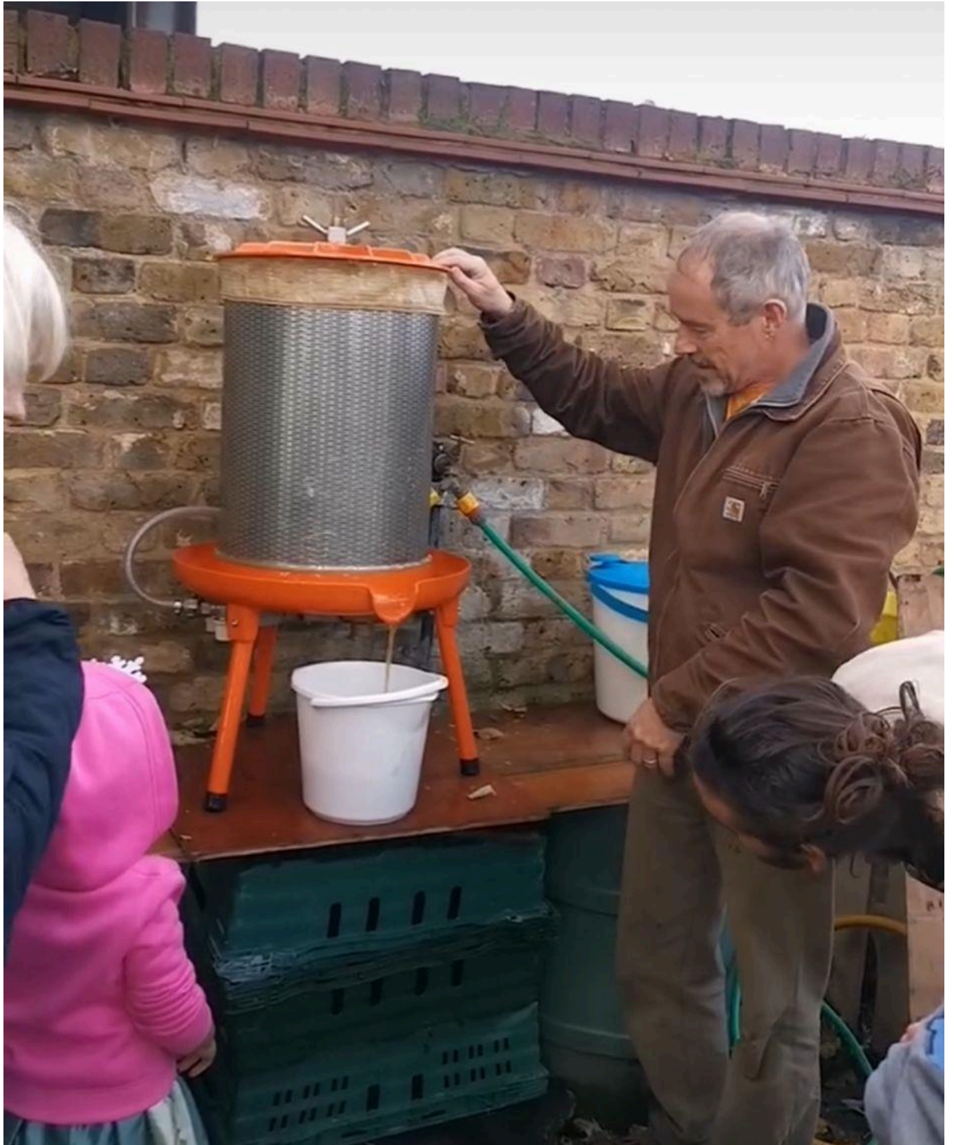
Apple Day Juicing