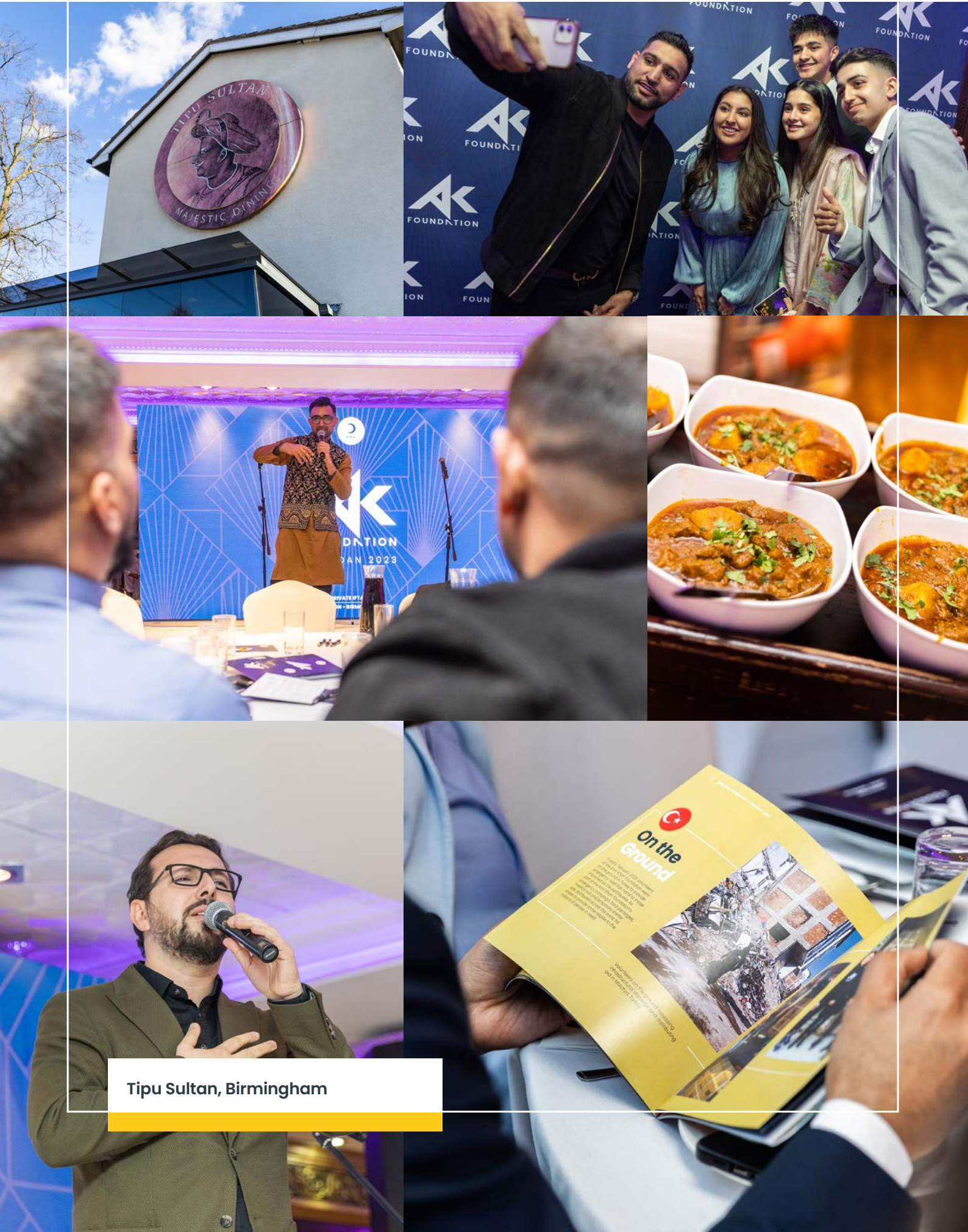
Tipu Sultan, Birmingham