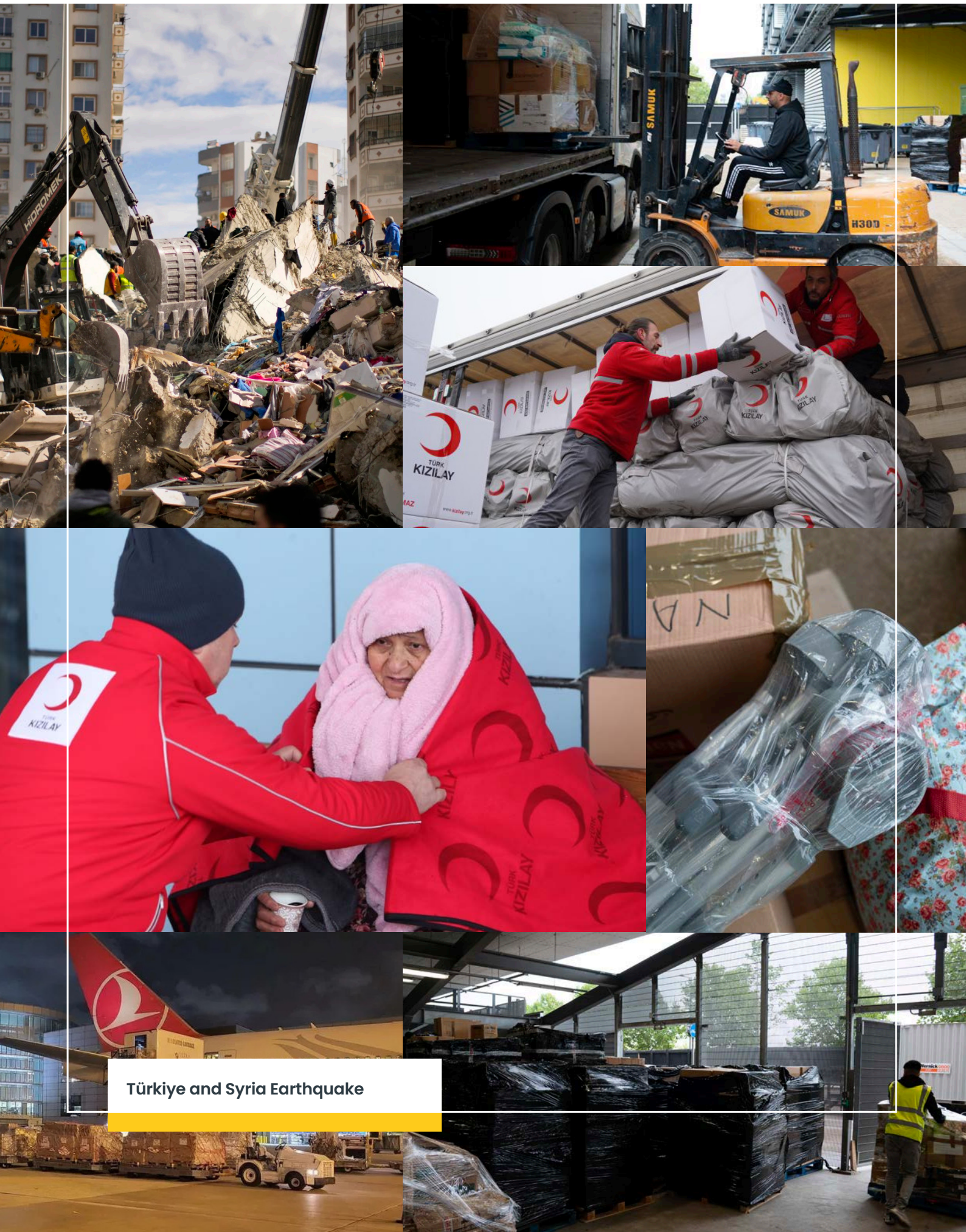
Türkiye and Syria Earthquake