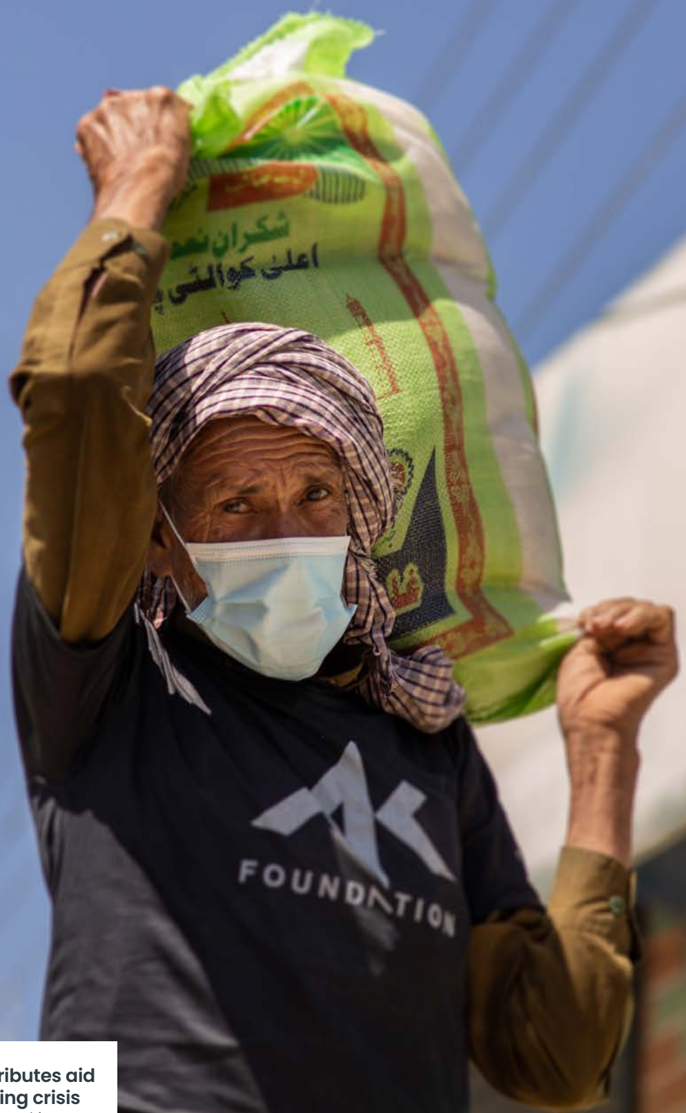
A volunteer disitributes aid amidst the flooding crisis Dera Ismail Khan, Pakistan