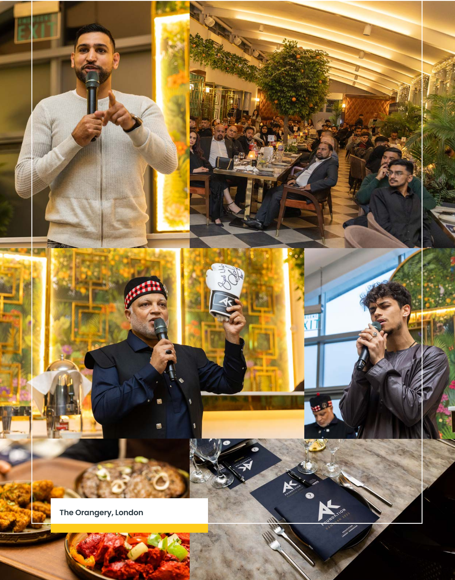
The Orangery, London