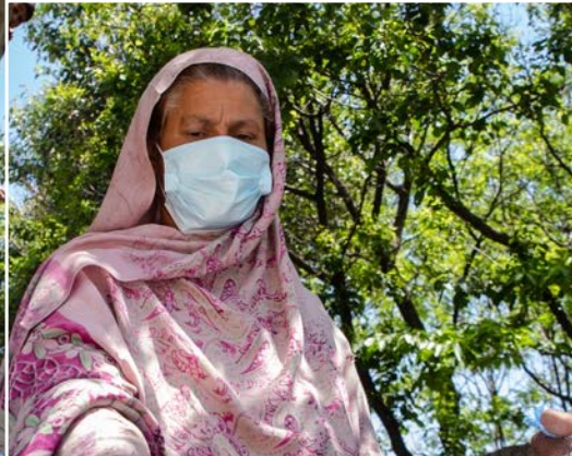
KHYBER PAKHTUNKHWA, PAKISTAN