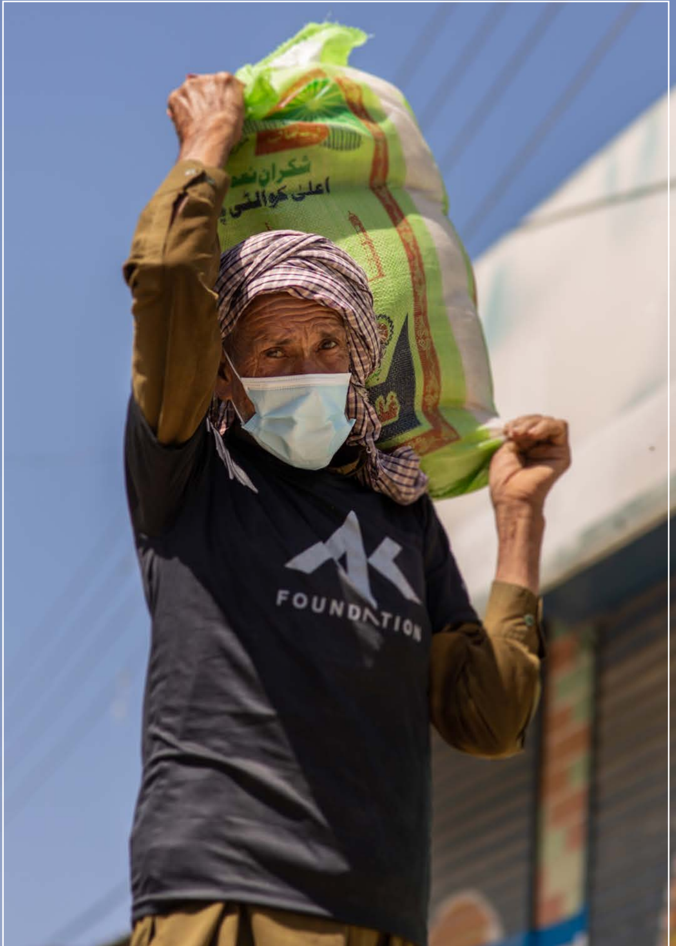
FOOD POVERTY PAKISTAN - RAWALPINDI, PAKISTAN