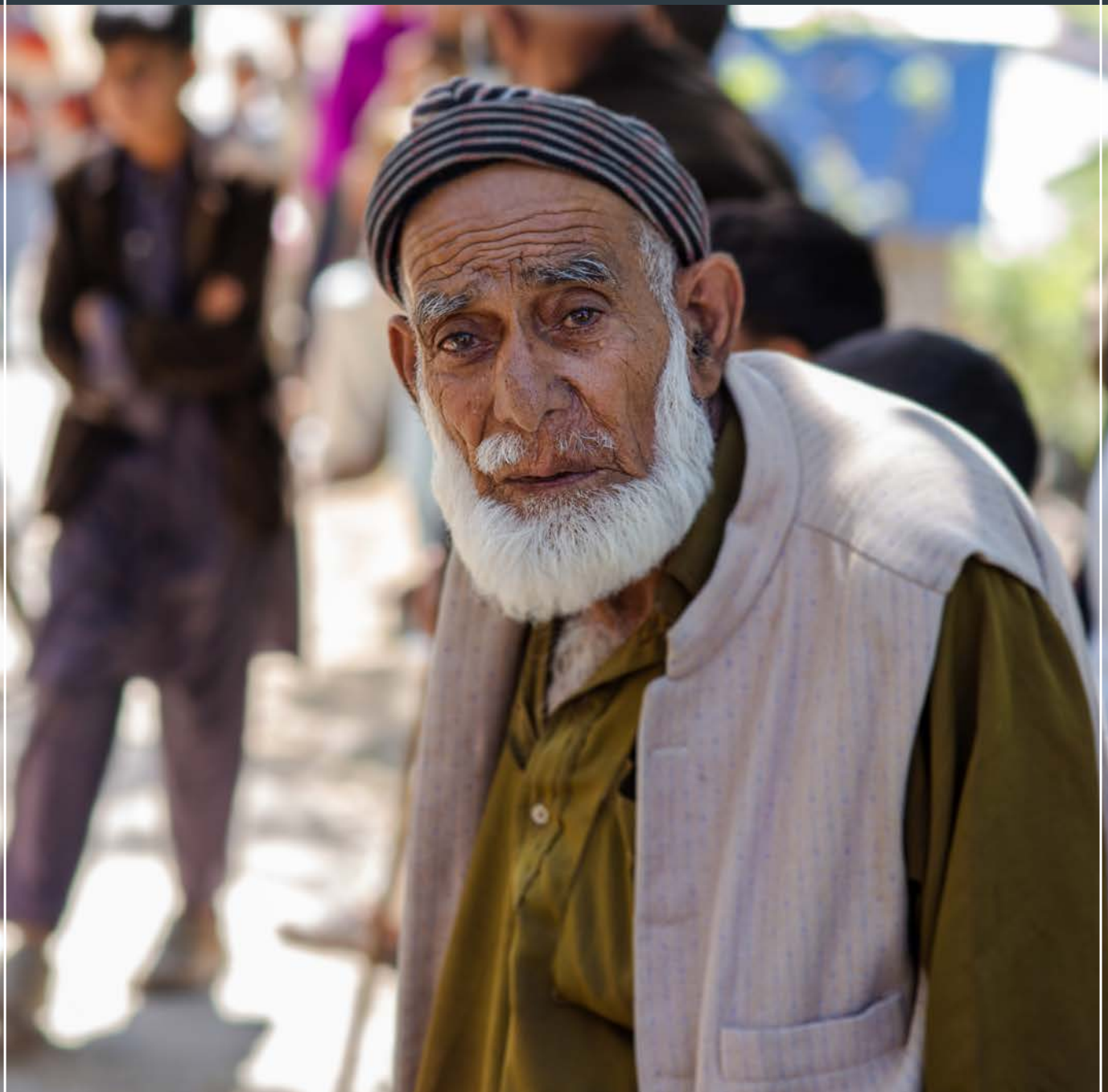
FOOD POVERTY PAKISTAN - AZAD JAMMU & KASHMIR