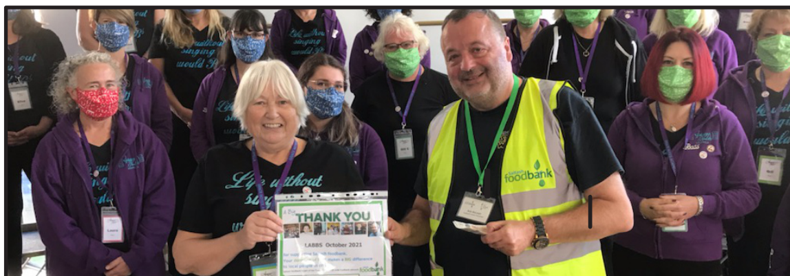
Thank you to LABBS on 30th October 2021, for your generous donation of food to Saltash Foodbank and for the £100 raised in the raffle towards our running costs.

I would just like to say thank you so much for helping me out. Been down a long road the past years or so. Getting help and support now. Hopefully getting involved and volunteering at the community kitchen / cafe to get back on my feet again and find myself to move forward. I feel so lucky to live in such a caring town.