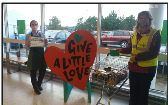
Waitrose have been strong Foodbank supporters

Hi. Thank you so much for the food and the dog food you've really humbled us I can't put into words how I feel less alone the others and if I'm really honest I've got tears in my eyes thank you so much for your help but you sent today will keep us for over a month so God bless you and thank you once again for your help. Xxxxxx, xxxxx, xxxxx and the two four-legged humans Cxx and Hxxx thank you once again 🙏🙏🙏🙏🐾🐾🐾🐾💕