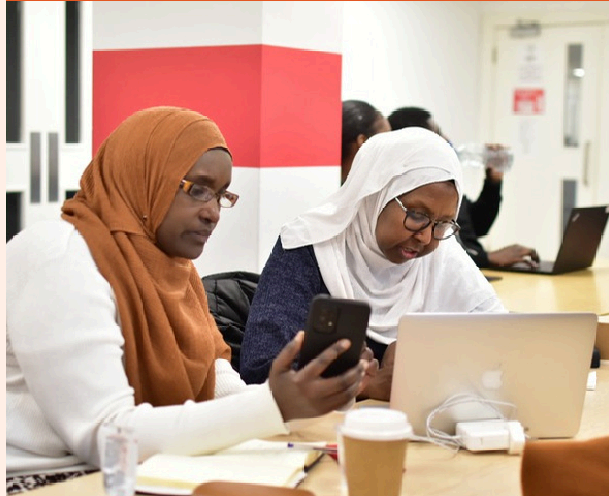
AVOCADO+ Accelerator Fellows