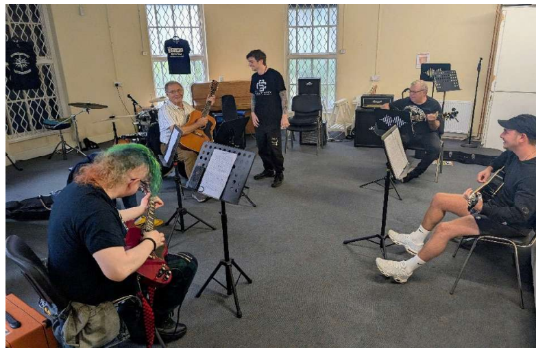
Guitar Social group

Social drop-in sessions for the local community continue to be popular with people of differing ages and from all walks of life. This group is led by a prior youth member of the Soundroom, who facilitates this group in addition to running his own Guitar Tuition School.