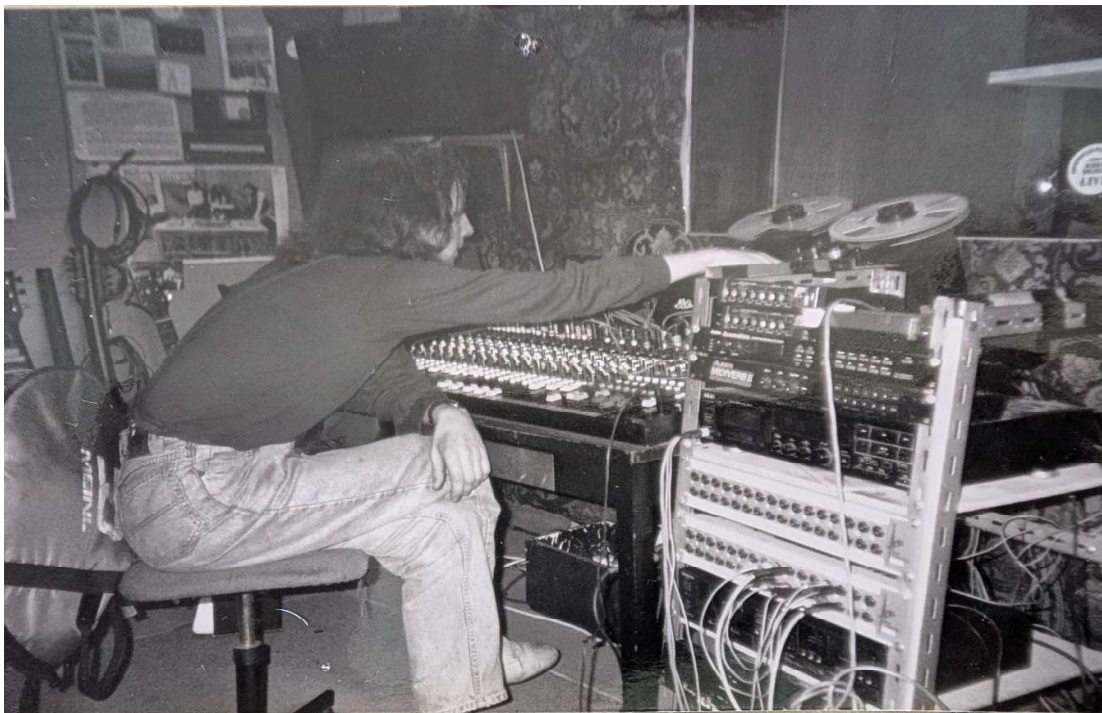
Photograph of The Soundroom original recording studio in the 1980's

The Board of Trustees has referred to the Charity Commission's guidance on public benefit when reviewing the Charities objectives and planning its future activities. This Annual Report aims to demonstrate the link between our charitable activity and how this benefits our service users.