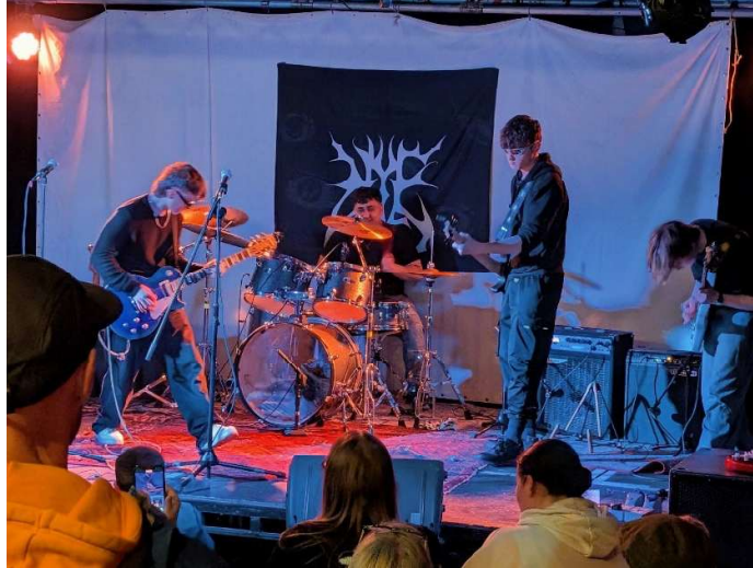
Gid night for our Youth Music

We currently run two open-access youth groups, and a free rehearsal night for Youth Bands we have also continued to deliver term-time activities for young people thanks to funding from the Community Foundation and Barbour Foundation.