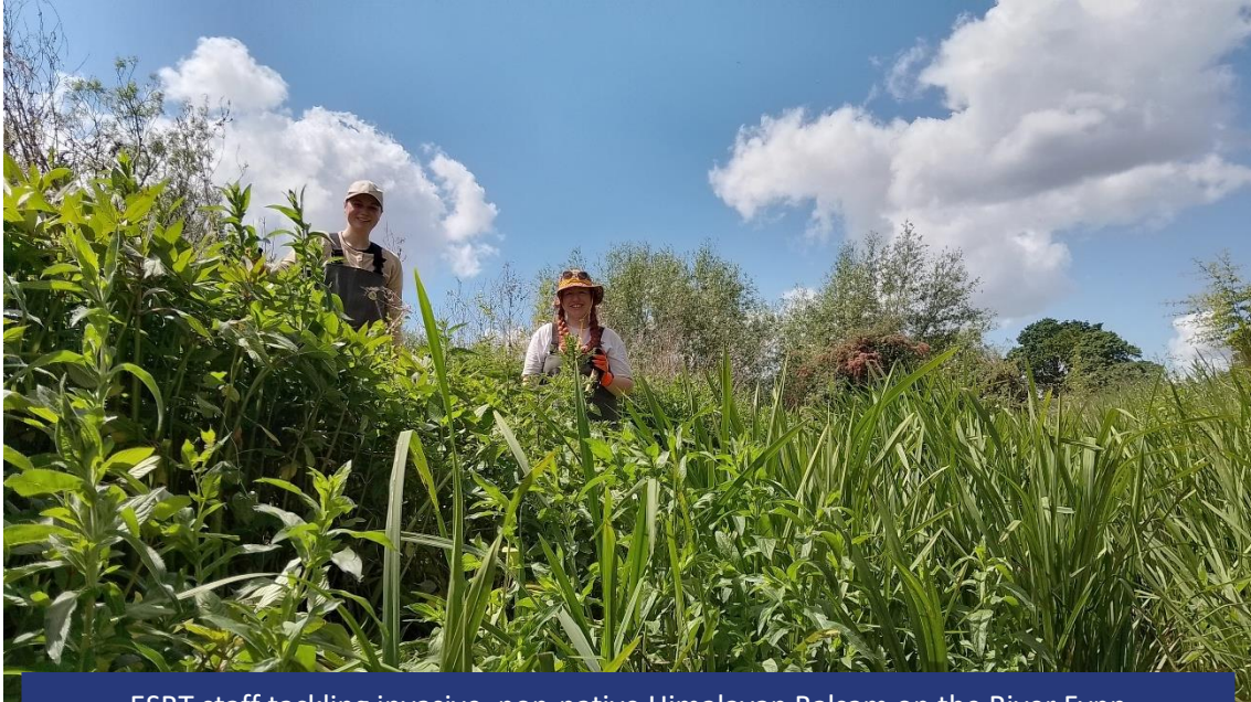
ESRT staff tackling invasive, non-native Himalayan Balsam on the River Fynn