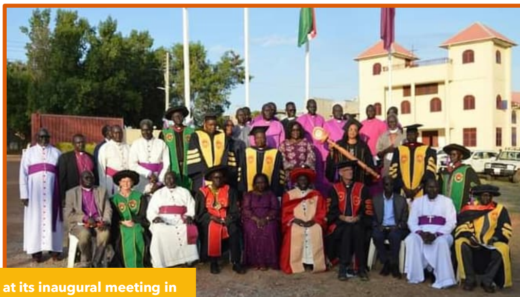
The Governing Council at its inaugural meeting in Juba

Quarterly reports from ECSSSUP are shared with TEU to promote transparency and accountability. ECSSSUP continues to work with TEU's leadership team to build capacity in this area.