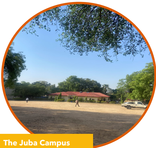
The Juba Campus

A large EMI team visited South Sudan again in late 2022 focused on redevelopment of the Juba site of TEU, currently occupied by the Bishop Gwynne School of Theology and the School of Law, as well as student accommodation and administrative offices. Topographic surveys were carried out, boundary lines established, and a full engineering plan and architectural design for the redevelopment have been completed by EMI, in partnership with TEU's Engineer and Project Director.