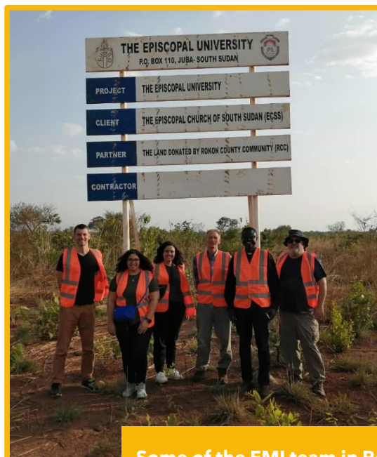
Some of the EMI team in Rokon

2023 saw significant development in the critical first phase of this project – the building of a fence and a main entrance gate to secure the land. Two senior members of staff were hired by TEU to manage the project in partnership with EMI – an Engineer and Project Director. Preparation was completed by TEU and EMI for the bidding process to select a contractor for the building of the fence. Bids were received in January 2024. After a rigorous assessment process, a final contractor was selected from a shortlist to carry out the work. At the time of writing, work has begun and is due to be completed in June 2024.