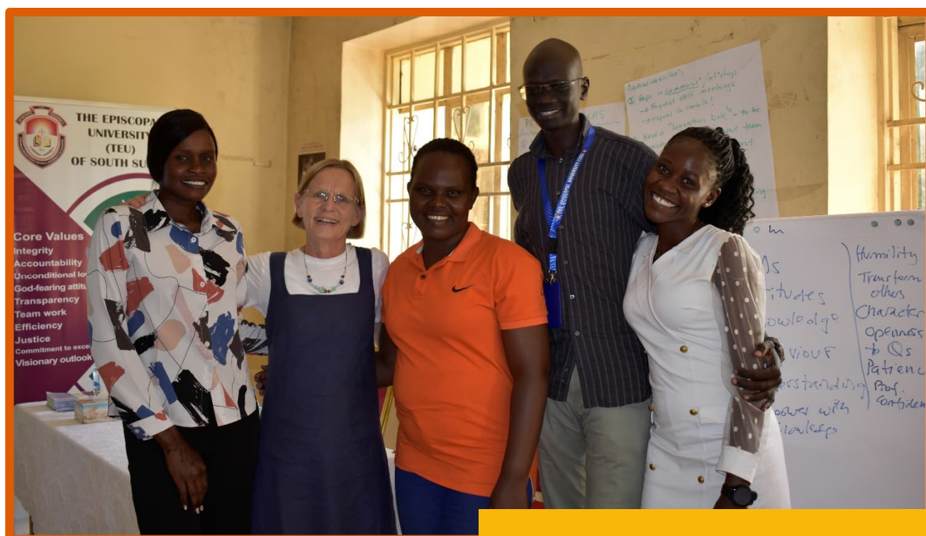
Some of the core TEU staff team working together in Juba

TEU is continuing to relate to its affiliated institutions in Maridi, Wau and Kajo Keji. In order to enable these colleges to offer university accredited programmes, they will need to deliver the same curriculums as TEU in Juba, and ensure they have sufficient numbers of staff with postgraduate qualifications that are authenticated by the Government of South Sudan. For some, this is a difficult hurdle to overcome, and a focus of TEU's work in the coming year will be to enable this to take place so that the multi-campus vision of TEU becomes a reality.