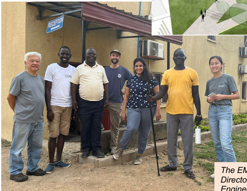
The EMI Team, together with the TEU Director of Operations and TEU Architect and Engineer on the Juba site.

The establishment of a partnership with EMI and the costs of accommodating the teams were largely – but not totally – met through the remainder of the large unrestricted grant received in 2020. The funding gap was met by ECSSSUP, resulting in a substantial deficit for the year (see Financial Review).