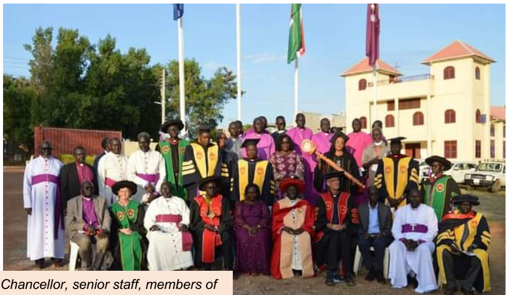
The Chancellor, Vice Chancellor, senior staff, members of the Governing Council and bishops gathered for a photo at the inauguration. The recently refurbished Juba Campus Chapel can be seen in the background.

TEU now offers a BA in Law and a Diploma in Theology. As the university continues to develop, students will be able to study many other subjects – as well as working towards a BA in Theology. The university was formally inaugurated on the 13 th November 2022 at its Juba campus – with much jubilation. Read more below!