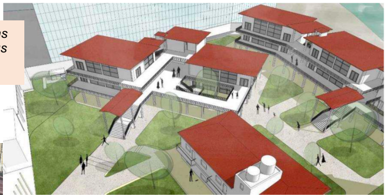
Drawings of proposed designs and plan for the Juba Campus educational buildings..